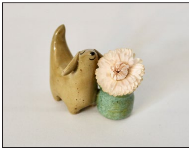
(LEFT) “Ocre Weenie with Cactus Vase” by Avizia Long. (RIGHT) “Amethyst in Shade” by Denese Stack.

The exhibit features a variety of creative media, and some that are quite surprising. Woodworking, ceramics, watercolors, oils, and acrylics, but also pyrography (woodburning), heavy texture acrylic, polymer clay jewelry, fused glass, fiber, wool, copper, and more. The pieces range from one inch up to eight inches, and prices start at $10, with most being around $30 to $50.