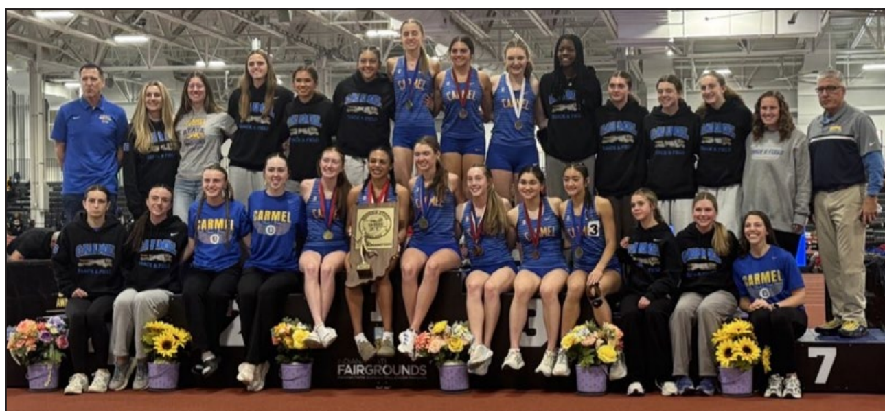
The Carmel girls track and field team defended its Hoosier State Relays Large School division team championship. The Greyhounds scored 63.5 points at this year's meet, which took place Saturday, March 28 at the Indiana State Fairground Coliseum.

Noblesville scored four points, tying for 32nd. Ains-