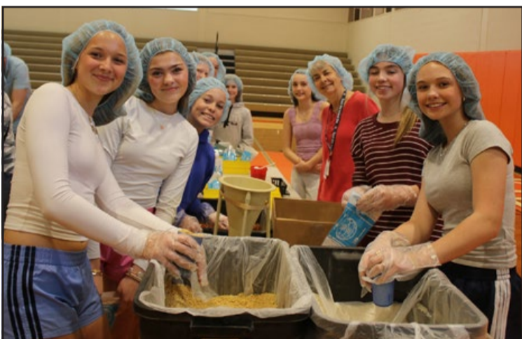
Hamilton Heights eighth-grade students helped pack food for distribution in West Africa. It was part of the T1L1 community service project that took place on March 25.