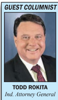
TODD ROKITA Ind. Attorney General

I am calling on Indiana House members to adopt the substance of Senate Bill 250 , as passed by the Senate, to align Indiana law with the new federal definition of hemp and end the sale of illicit marijuana products masquerading as “low-THC hemp.”