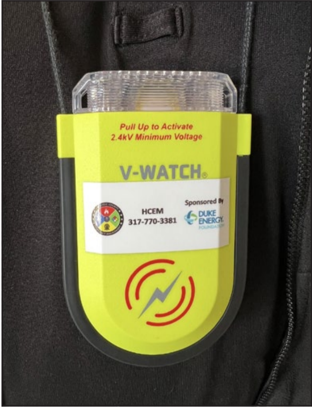
Photo provided The V-Watch can detect 2,400 volts and above – an invaluable tool to ensure first responder safety during and after an emergency.

into a pivotal tool for emergency operations, reinforcing its importance in protecting the community. In addition, HCEM has provided several responders with voltage detectors, which are essential for ensuring safety after storms. These devices help teams identify potential dangers, such as fallen power lines, making them a critical tool for safeguarding responders during recovery operations. When storms cause trees and power lines to fall, these voltage detectors will be instrumental in protecting those working on the front lines. These comprehensive initiatives have been made