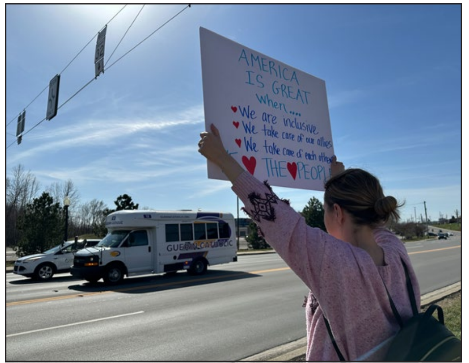
A group of Veterans and allies gathered Tuesday afternoon along State Road 32 at Federal Hill Commons in Noblesville with the theme of "Take Back Our Rights." They will march again from 4 to 6 p.m. Thursday at the same location and welcome anyone who wants to join them.