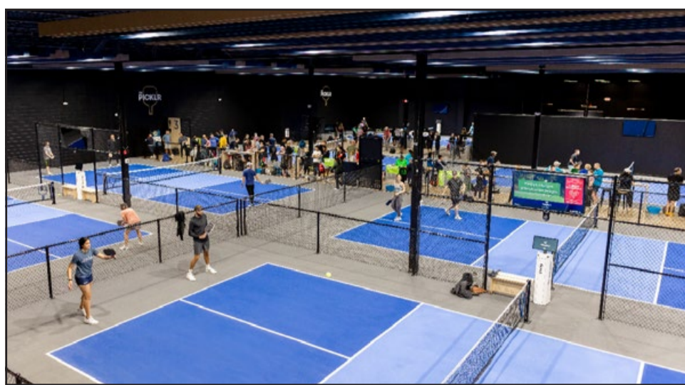
Photo provided The Picklr Keystone Crossing location on 82nd Street in Indianapolis.

Paid for by official funds authorized by the House of Representatives.