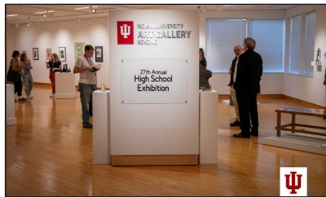
Photo illustration by Shea Lazansky / IU Kokomo The students’ work will be on display in the gallery through April 2.

Read more great play reviews from A Seat on the Aisle at asota.wordpress.com .