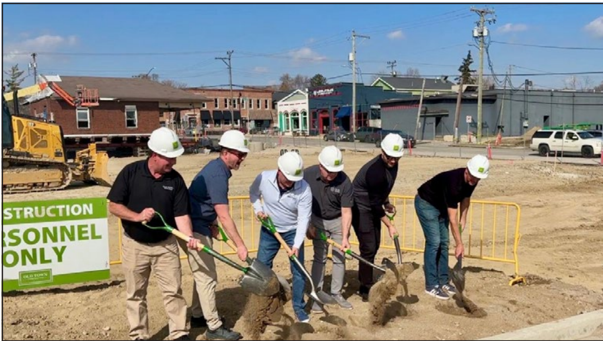
The City of Westfield and the Westfield Chamber of Commerce held a ceremonial groundbreaking last Friday, March 14 for the forthcoming Sun King Brewery. This Sun King will be part of the new Union Square development just north of Grand Junction Plaza.