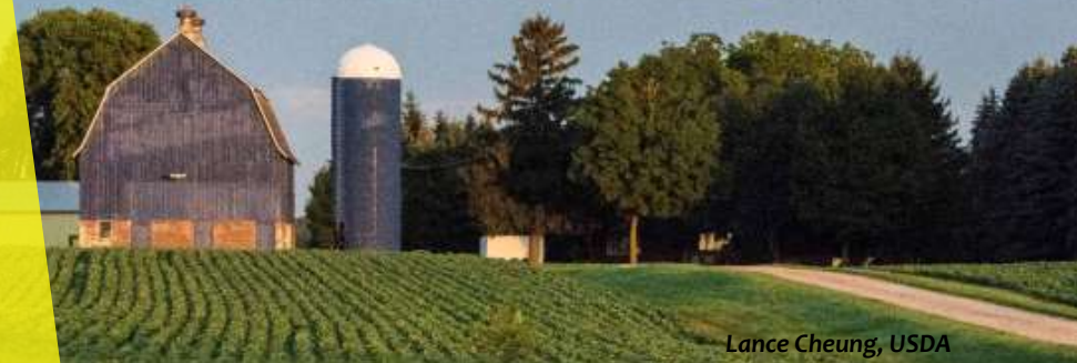
Lance Cheung, USDA