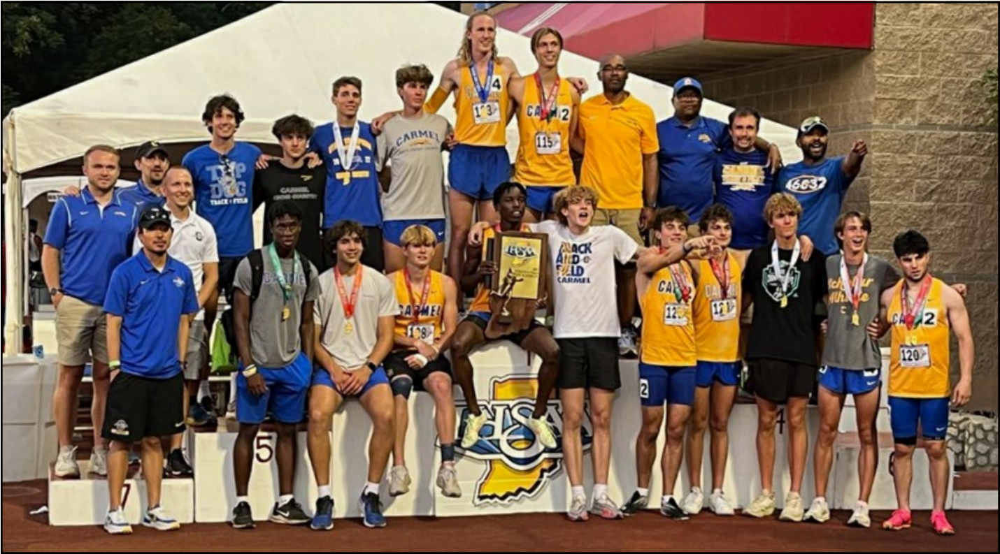
The Carmel boys track and field team finished as runner-up at the IHSAA state meet, which took place Friday at Indiana University in Bloomington. The Greyhounds scored 50 points, marking their seventh finish in the top two at the state meet.