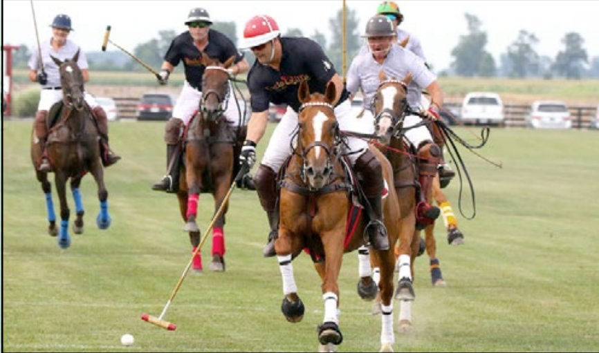
Polo for the Playhouse is an opportunity to enjoy a fun evening out and support local community theater and therapy services for youth and adults.

admission as well as a package combo of sandwiches, snacks, desserts, a bottle of red and bottle of white wine, bottled water, and a few other bonus items thrown in for your fun-filled evening. You are welcome to bring your own pop-up tents, chairs, picnics, and refreshments. Grills, however, are not allowed. Leashed pets are welcome as long as you clean up after them. There will be a bourbon pull, wine pull, 50/50 raffle, barn tour, an Airplane Candy Drop, other surprises, and an exciting night of polo.