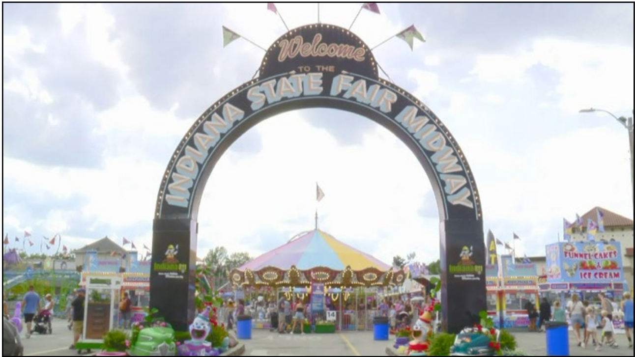
A view of the Midway entrance at the Indiana State Fair.