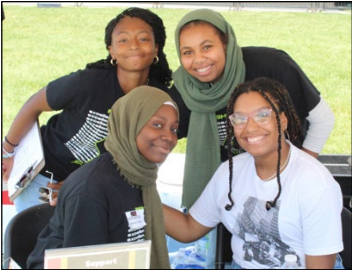
Since 2020, Fishers High School's Future Black Leaders Club has organized the Juneteenth Jubilee.

and will be held at Conner Prairie from 5 to 8 p.m. on Monday, June 19. This event is free and open to all. Juneteenth Jubilee has been organized and created by students from Fishers High School's Future Black Leaders Club since 2020 and this is the first year it will be held at Conner Prairie. This year the Kid's Zone will be expanded to include a playground, bouncy houses, face painting, balloon animals, games, and interactive music with Indy Music & Wellness. All activities in the Kid's Zone are free. Conner Prairie will offer balloon rides for a