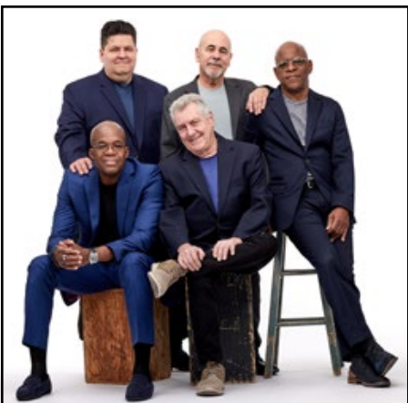
Tickets starting at $25 go on sale this Friday at TheCenterPresents.org .

starting at $25 go on sale this Friday at TheCenterPresents.org . et purchases can be applied toward subscription packages when the full 2023-2024 season is announced May 23.