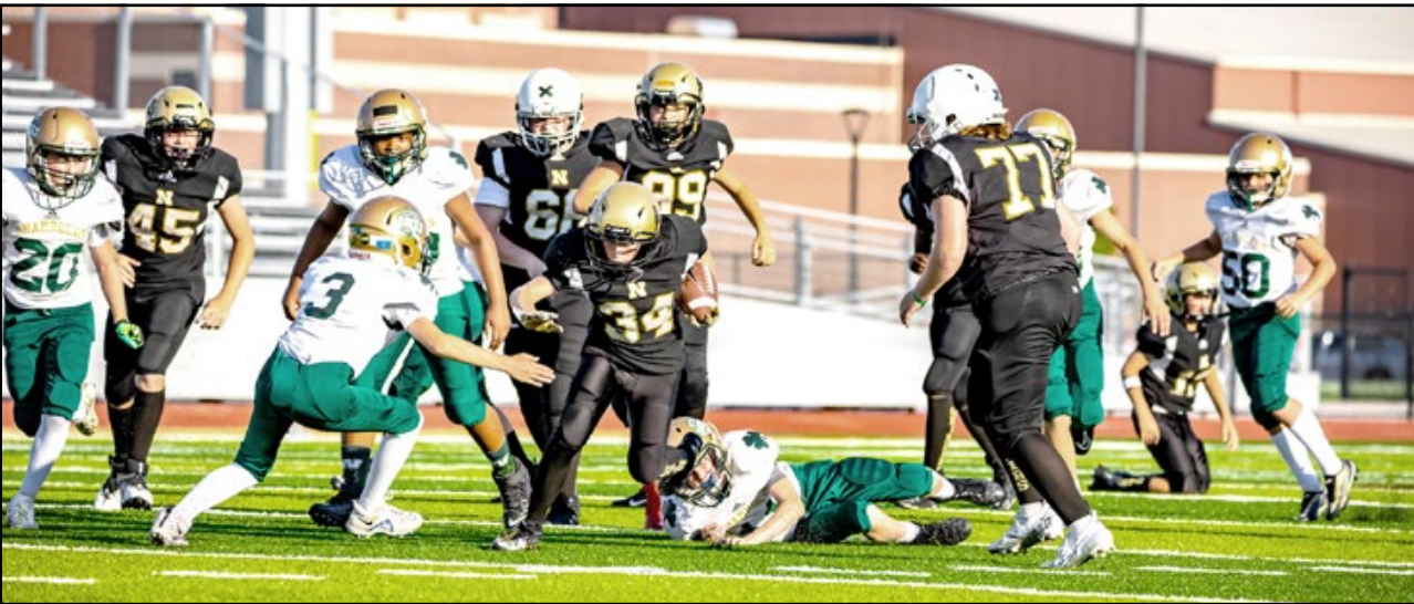
The Noblesville Grinders, shown here during their game with Westfield on Aug. 5 at the new Beaver Stadium, are the Noblesville Elementary Football League’s well-established travel team, playing since 1967. The NEFL is one of 17 organizations that are part of the new Noblesville Youth Sports Alliance, which help to promote youth sports in Noblesville.