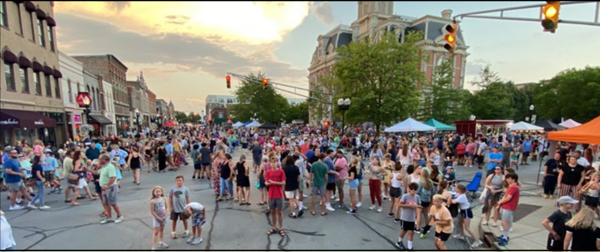
The annual Noblesville Street Dance had people – you guessed it – dancing in the streets on Saturday, Aug. 6. As you can see above, the event organized by our friends at Noblesville Main Street was wildly successful. The Street Dance immediately followed the annual Art Fair on the Square. Main Street, the organization behind the Noblesville Farmers Market, is currently gearing up for the Chocolate Trail as well as Music & All That Jazz. Keep reading The Reporter for more details. You can also find out more at NoblesvilleMainStreet.org/events.