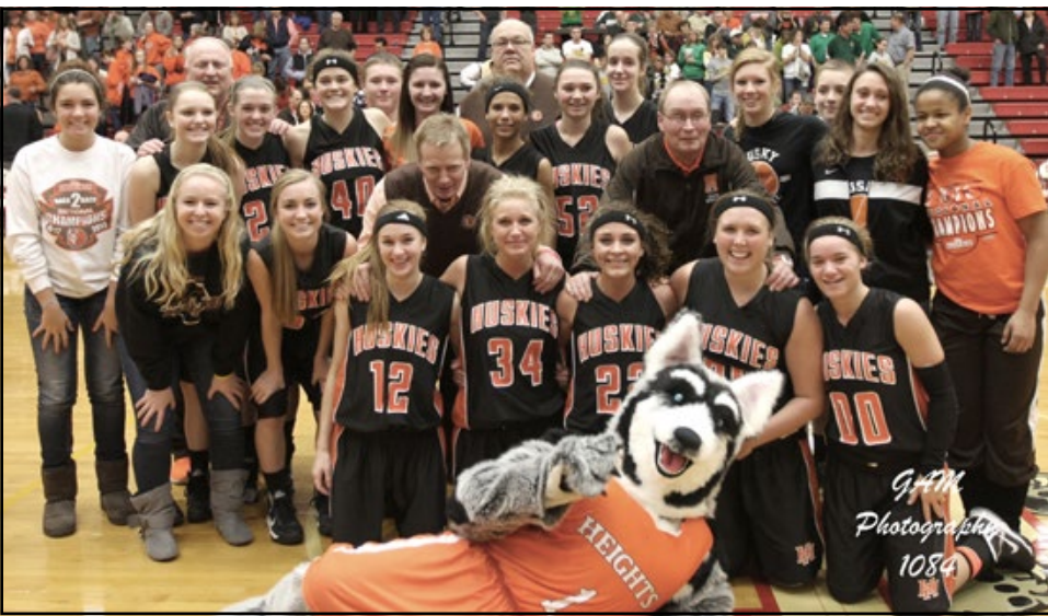
Hamilton Heights 2012-13 Hamilton Heights Girls State Runner-Up Team, Class of 2022 Hamilton Heights High School Athletic Hall of Fame inductees.