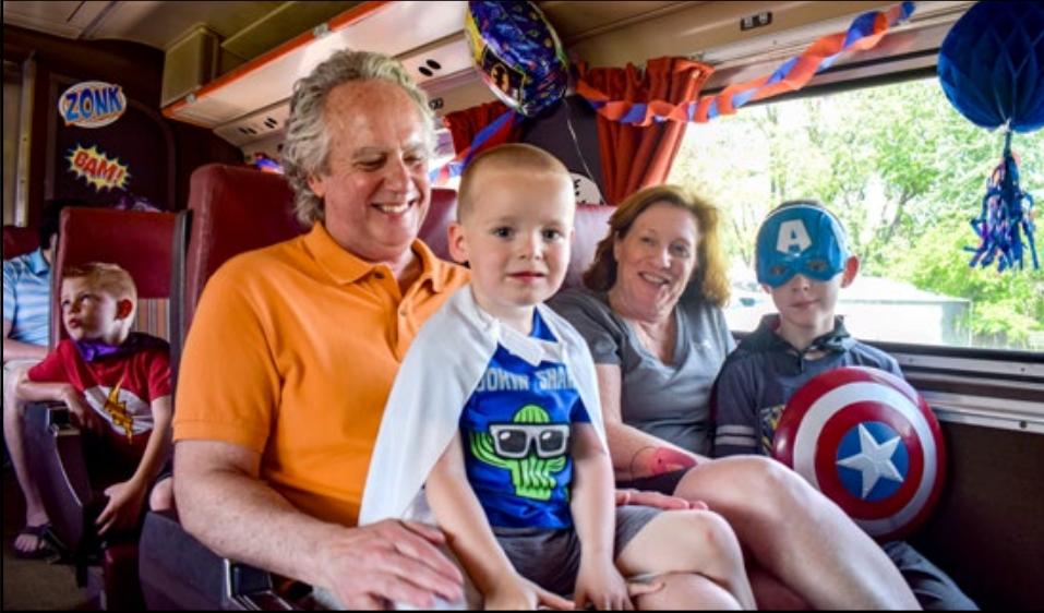
Superheroes of all kinds will once again board the Nickel Plate Express.

The REPORTER Join your favorite superhero for a special train ride Sept. 10 and 11. For one weekend only, Superhero Express will take over Nickel Plate Express (NPX) for a one-of-a-kind train ride your kids won't soon forget. Start the day off with a special superhero training. Learn new moves from Spiderman, Batman and Catwoman. Upon completion of superhero training, each young superhero will receive his or her own cape. After superhero training, hop aboard NPX to practice the new moves during the 65-minute family train ride. Passengers will enjoy superhero juice and cake pops while riding on the historic 1950s train. Passengers will board the unique, tall railcars from the beautifully restored Hobbs Station platform, located inside Forest Park in Noblesville. Tickets for the Superhero Express start at $34 per person. The Superhero