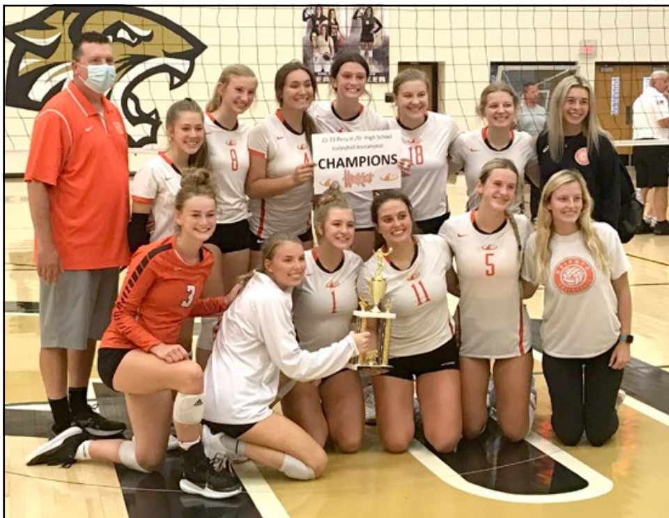
Hamilton Heights won four matches to claim the trophy at the first-ever Peru Invitational last Saturday, beating North Miami in the championship.