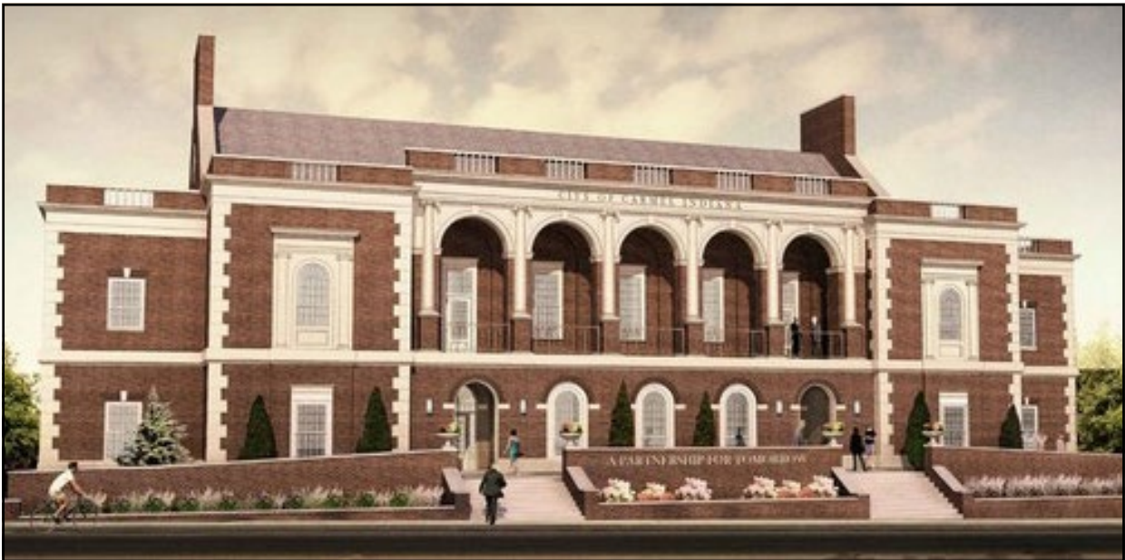
Rendering provided by City of Carmel The City of Carmel will hold a groundbreaking ceremony for what will be the new Police Department Headquarters and City Court at 2 p.m. on Thursday, Aug. 18. The ceremony will take place on Red Truck Road, which is currently closed to vehicle traffic, near the northeast corner of the Carmel Police Department building. Parking is available in the parking lot behind the Old Spaghetti Factory, which is accessible from Veterans Way at the west end of Red Truck Road.

while having fun using apps like Cargo-Bot. Puzzles challenge them to teach a robot to move crates. Another great subscription-based option is Kodable. Offering an array of activities that familiarize kids with coding skills, along with opportunities to create original programs, this self-guided approach allows kids to master 21st century tech skills at their own pace. Interactive books Explore exciting new ways to learn with the touch-and-talk pages of the LeapStart Learning Success Bundle. This interactive system includes activities such as games, puzzles and creative challenges to enhance learning and help kids build math, reading, problem-solving skills and more. It comes preloaded with the Go! Go! Cory Carson Superhero School book based on the popular animated series and an additional activity book, and can be expanded with the compatible LeapStart library of books. Covering a variety of preschool through first grade subjects for 2- to 7-year-olds, each title features more than 30 re-playable activities, so kids can start at the right level and move up when they’re ready.