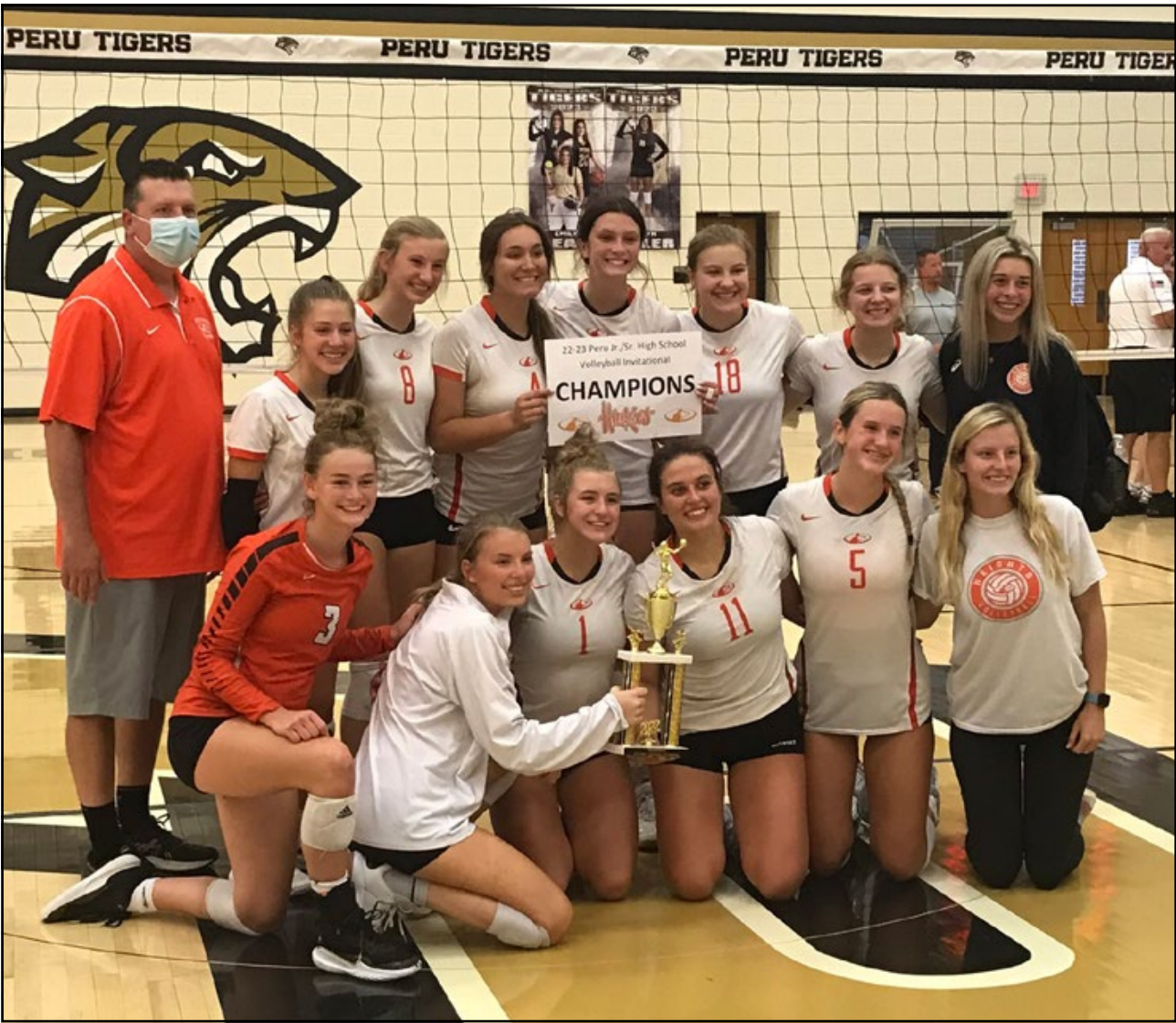
Hamilton Heights won four matches to claim the trophy at the first-ever Peru Invitational on Saturday, beating North Miami in the championship.