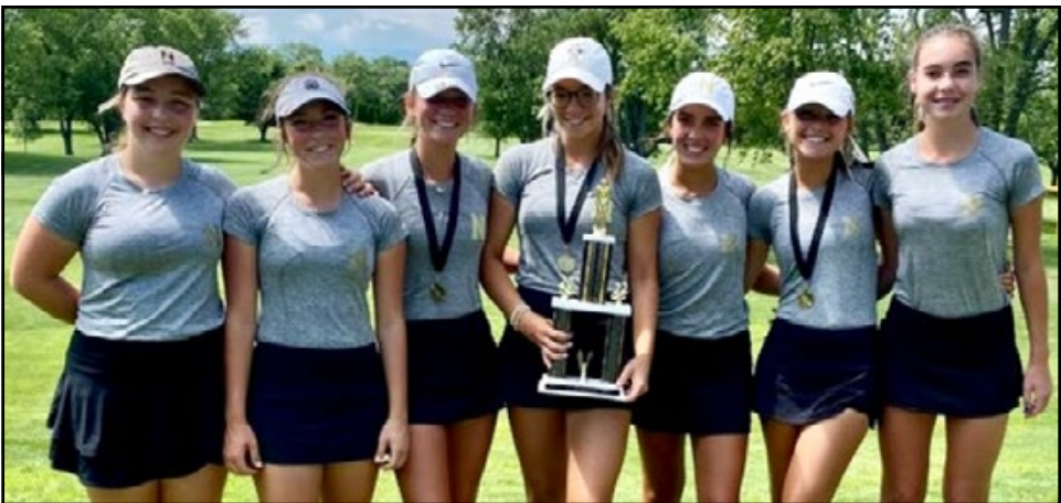
The Carmel and Noblesville girls golf teams picked up invitational wins on Saturday. The Greyhounds (top) triumphed at the Zionsville Invitational, while the Millers (above) were first at the Lapel Invitational.