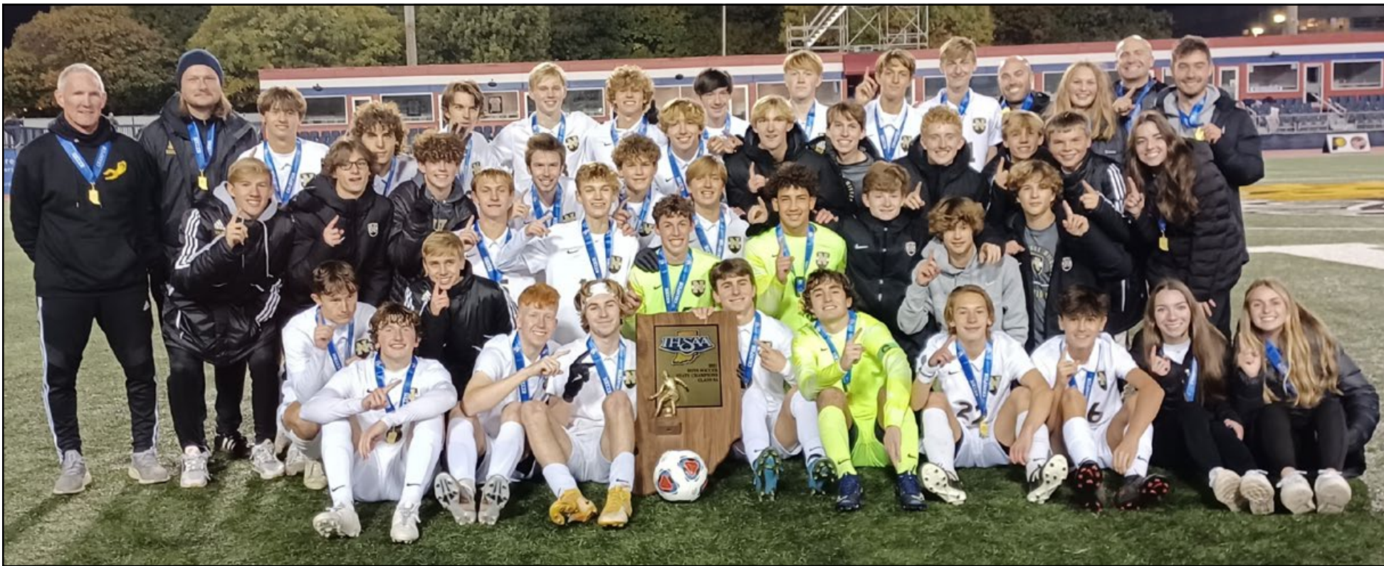
The Noblesville boys soccer team triumphed in the Class 3A state championship game last season. The Millers will play at Fishers to begin Sectional 8 play in this year's post-season.