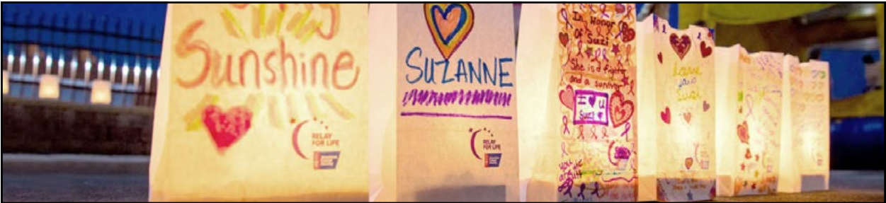
This year's Hamilton County Relay for Life starts at 4 p.m. this Friday, July 15 at Grand Park.