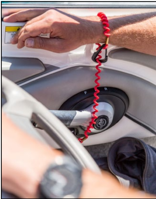
(Left) Boat fire extinguishers expiration date can be two or four digits; if it is two, as in "08," that means 2008. (Right) Engine cutoff switches (ECOS) are often activated by a lanyard connected to the operator that, when pulled, stops the boat's engine.