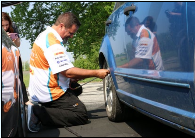
A Gleaners patron with a flat tire had no idea the level of service she would receive.