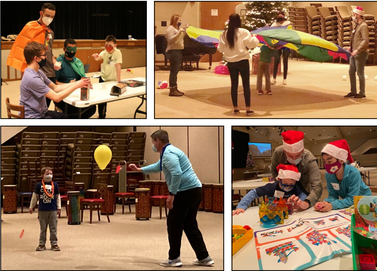
Noblesville First UMC's quarterly Respite Nights can do great things for kids with certain disabilities.