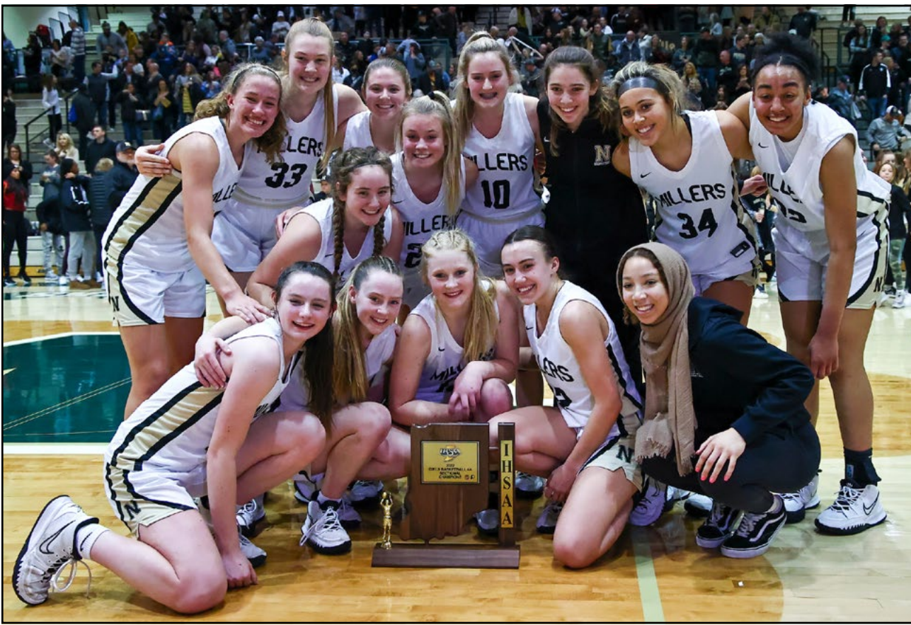
The Noblesville girls basketball team defended its Sectional 8 championship last Saturday at Westfield, beating Fishers 54-48. It's the first time the Millers have won back-to-back titles in over 30 years.

"I was really proud of our fight in the second half,"