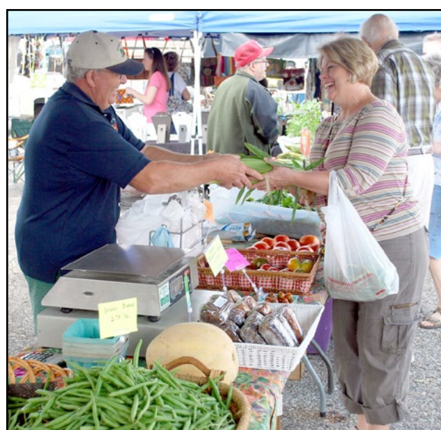
This summer marks 31 years since the Noblesville Farmers Market began operations.

NMS recognized the need for this capability when market attendees inquired which vendors accepted SNAP payments. Due to the requirements involved, individual vendors are unable to participate in the program themselves. To use SNAP payment this summer, customers will debit money from their card at the NMS booth in