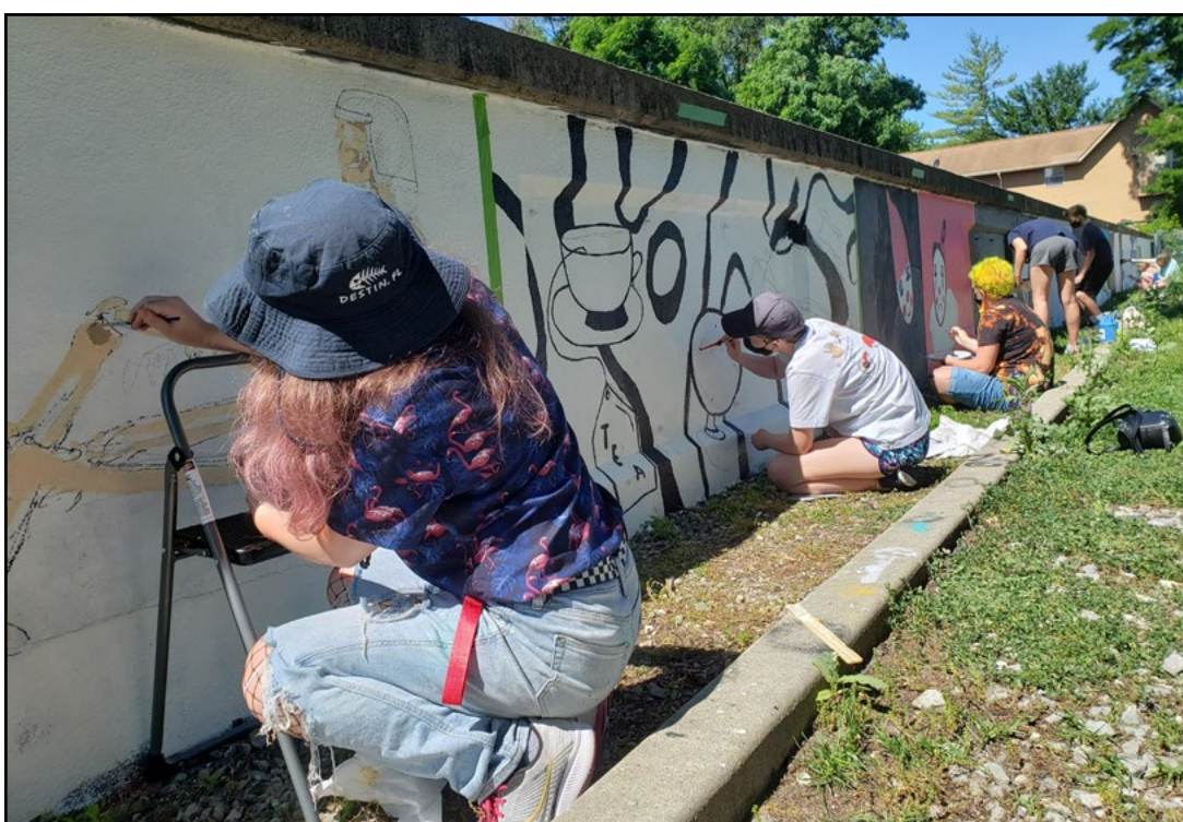
Young artists can help create public art in Fishers this July. But hurry – only 16 spots are available. Sign up at playfishers.com/472/Partner-Camps .

Witsken says that she hopes "the mural camp can give stu-