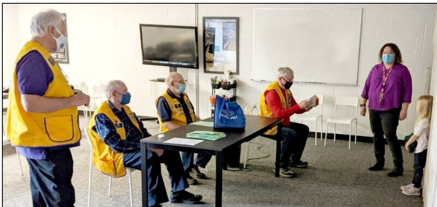
Last week, the Noblesville Lions provided vision screening to preschool students. On Jan. 31, they screened almost 100 students. The Lions provide school screenings across the school system throughout the year as a community service. This screening helps identify vision problems with students, which can later be checked by a family eye doctor.