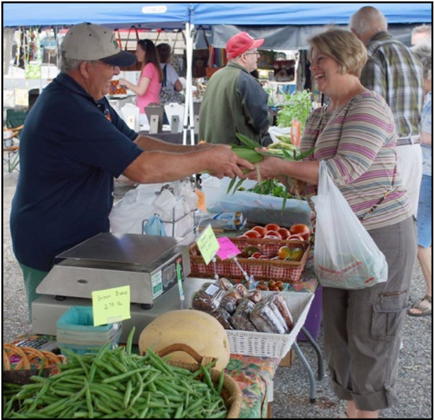
Photo provided This summer marks 31 years since the Noblesville Farmers Market began operations.

NMS recognized the need for this capability when market attendees inquired which vendors accepted SNAP payments. Due to the requirements involved, individual vendors are unable to patriciate in the program themselves. To use SNAP payment this summer, customers will debit money from their card at the NMS booth in exchange for tokens that can be used directly with