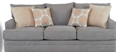
Chadwick Sofa compare at $1799 NOW $934.99**

OR SAVE AN EXTRA 15% STOREWIDE OFF OUR EVERYDAY LOW PRICES ** PRICES SHOWN REFLECT 15% SAVINGS