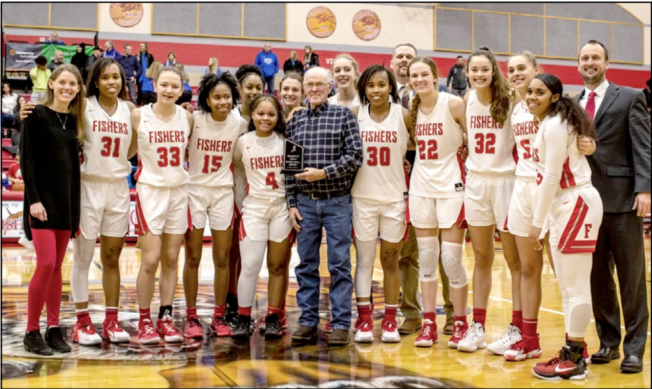
The Fishers girls basketball team won the Mudsock trophy last Saturday night, beating Hamilton Southeastern 69-61 in an exciting game at the Tiger Den. This is the third year in a row Fishers has won the Mudsock.