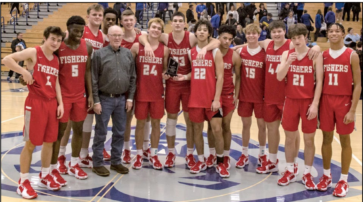
They worked for it: An exhausted but triumphant Fishers boys basketball team won the Mudsock game in double overtime 70-68 last Friday at Hamilton Southeastern. The Tigers improved to 6-1 with the victory.