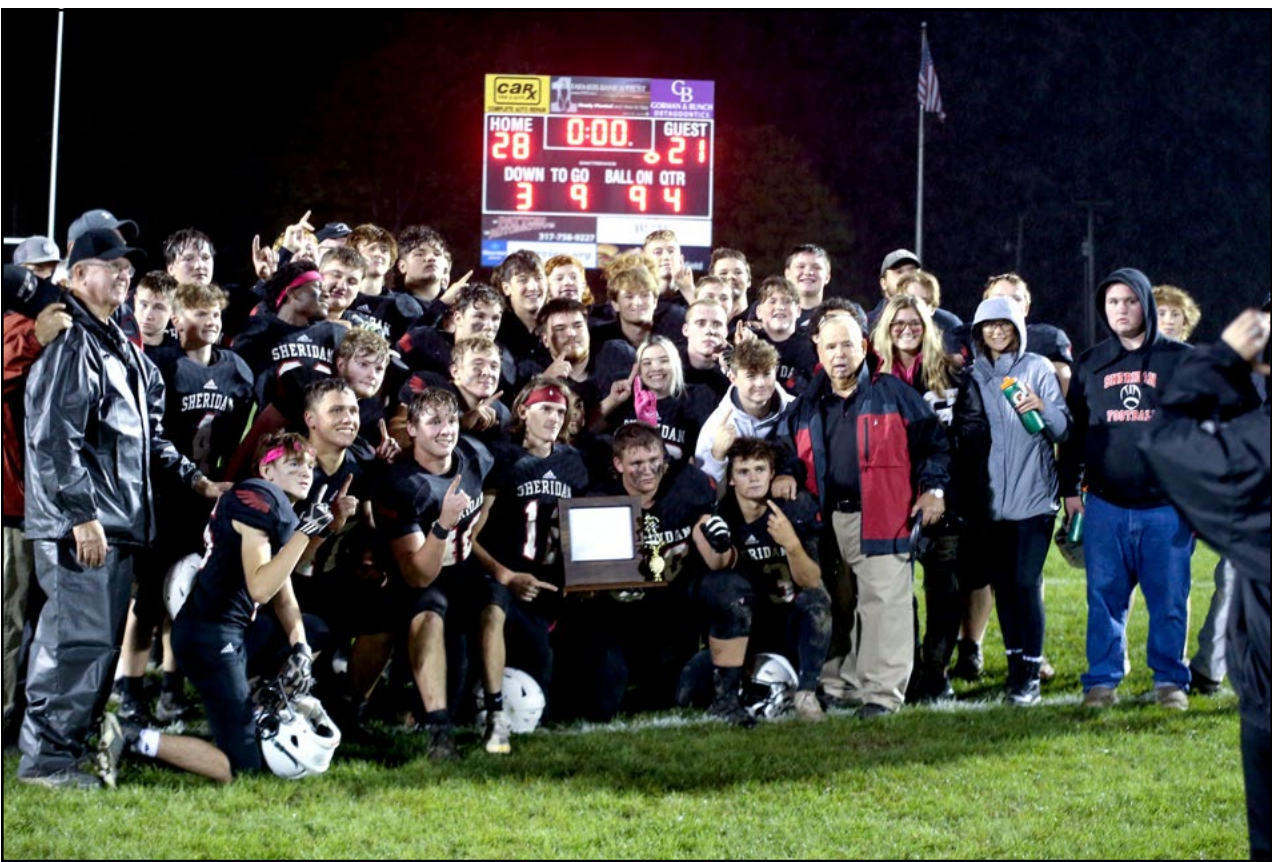
The Sheridan football team clinched the Hoosier Heartland Conference championship after beating Carroll 28-21 last Friday in a hard-fought game at Bud Wright Stadium. The Blackhawks finished HHC play with a 6-1 record and won their first conference title in three years.