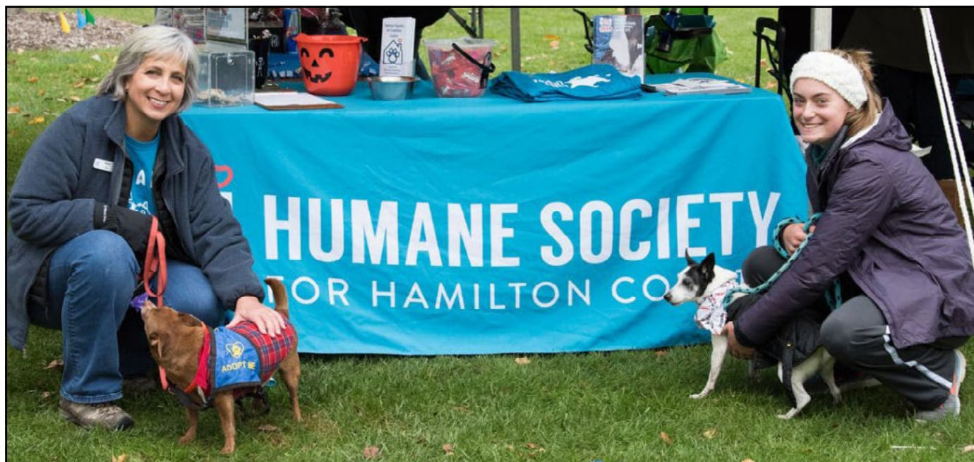
Barktoberfest returns for the fifth year this weekend. The event will take place from 11 a.m. to 3 p.m. on Saturday, Oct. 9 at Asa Bales Park, 205 W. Hoover St., Westfield. This annual event supports the Humane Society for Hamilton County through proceeds of ticket sales and adoptable pets available on-site. Pet-related vendors, food vendors, activities for both humans and dogs including a canine agility course, professional photo station and caricatures will be featured. The highlight of the afternoon will be the Pet Costume Contests taking place at noon, 1 p.m., and 2 p.m. Tickets can be purchased in advance at westfieldwelcome.com for $5 or on-site on Saturday (card only). You can register in advance for the Pet Costume Contests online as well.