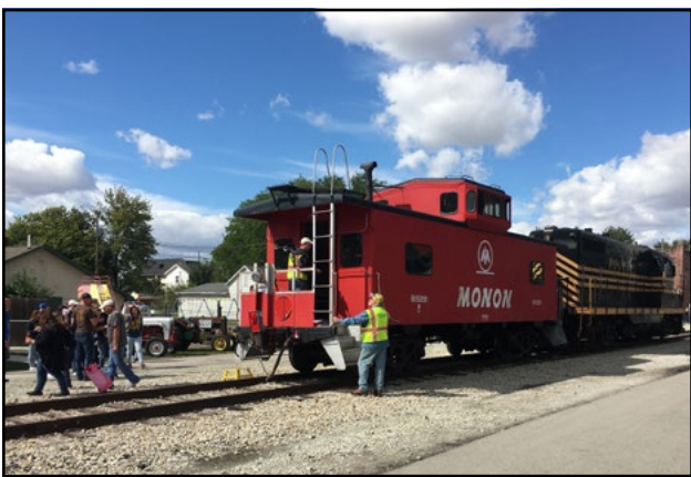
The Nickel Plate Express ran numerous 15-minute Caboose rides at the festival Saturday and Sunday. If you'd like to ride the train, go to NickelPlateExpress.com for tickets and info.