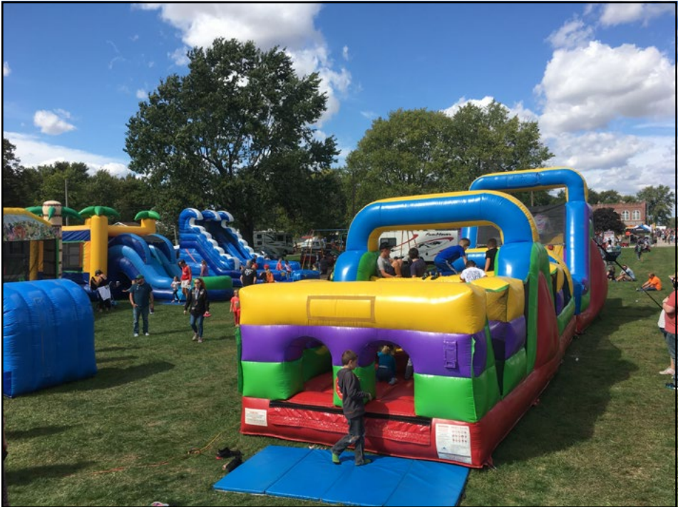
(Above left) The crowds Saturday were so large that many food vendors reported that they completely sold out and had to restock for Sunday. (Above right) The kids zone in Dolles Park is always a popular attraction, and this year was no different.