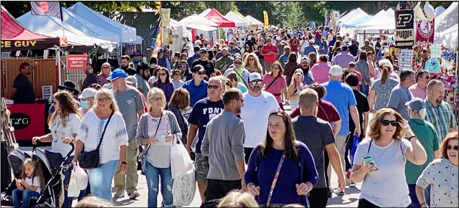
Early reports indicate as many as 80,000 people flooded the streets of Atlanta this past Saturday and Sunday for this year's New Earth Festival.