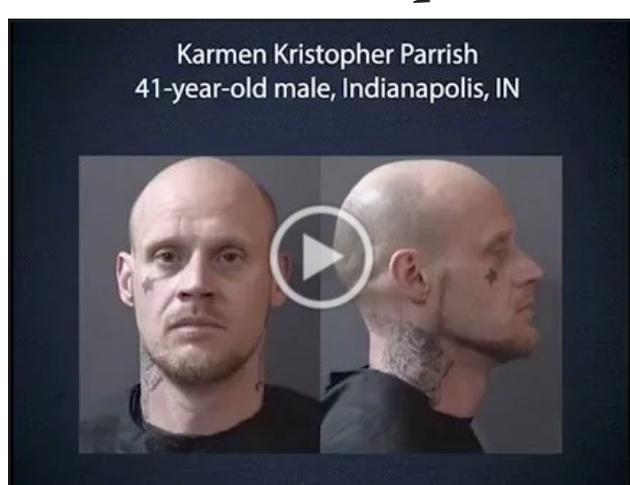
To watch the Critical Briefing Incident, go to tinyurl.com/3fte9zem. Please note the video contains disturbing language and graphic images.

While this is an unfortunate ending to any public safety call for assistance, this type of incident is a difficult reality of policing and one which needs to be fully and professionally investigated both internally and by independent, outside agencies. The Noblesville Police Department has completed our own internal administrative investigation. The Carmel Police Department has conducted its own criminal investigation, and has turned over its findings to the Hamilton County Prosecutor's Office for review. Throughout the process, our department