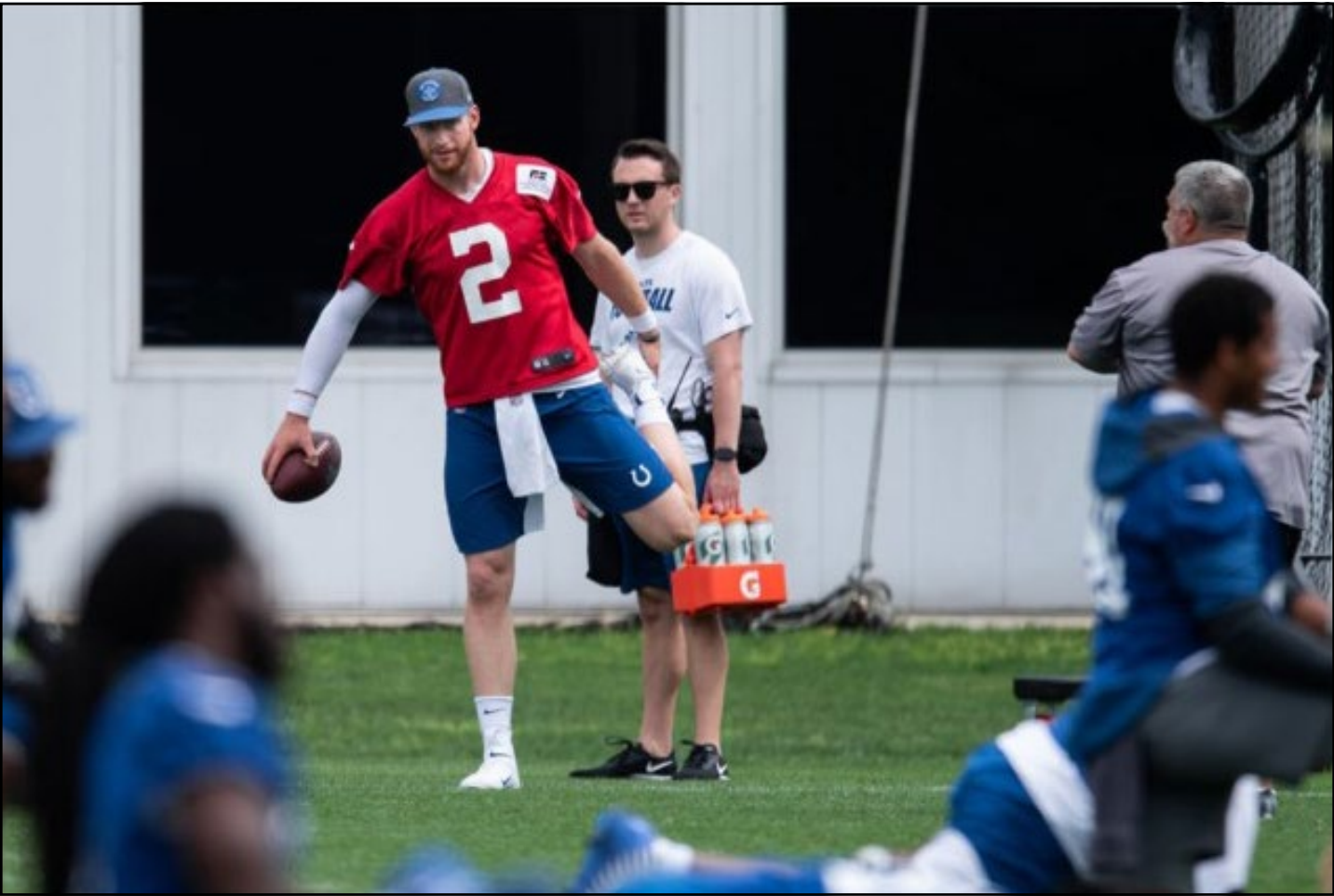
Colts quarterback Carson Wentz was among three players placed back on the active roster following "close contact" tracing that linked to a team staffer who tested positive for COVID-19 this past week.

"Trust me, it is a personal decision," Wentz said. "I'm not going to go into depth on why but I will say it's a personal decision for me and my family. I respect everybody else's decision and I just ask that everybody does the same for me. I know that's not the world we live in, not everyone is going to equally view things the same but yeah, no one really knows what's going on in someone else's household and how things are being handled. It's a personal decision. That's just where I'm at on it and with the protocols and everything the way they are, really for us, it's about understanding them clearly and making sure that we are dotting our I's and crossing our T's. All of those things so that we can avoid what happened this week with a couple of us." Wentz went on to share that his decision whether to get the vaccine remains "fluid" and it is one that "keeps me up at night." For now, Wentz and pro bowl linebacker Darius Leonard are two of at least a handful of key Colts who have elected to remain unvaccinated. "Trust me, I've weighed a lot of things," Wentz said. "I've factored in everything and I know what's at stake. I know all those things and like I said, it's where I'm at, where I'm at with my family and that's why - just understanding the protocol. To truly try everything we can to avoid what happened this week. It is what it is whether we agree or not with the pro-