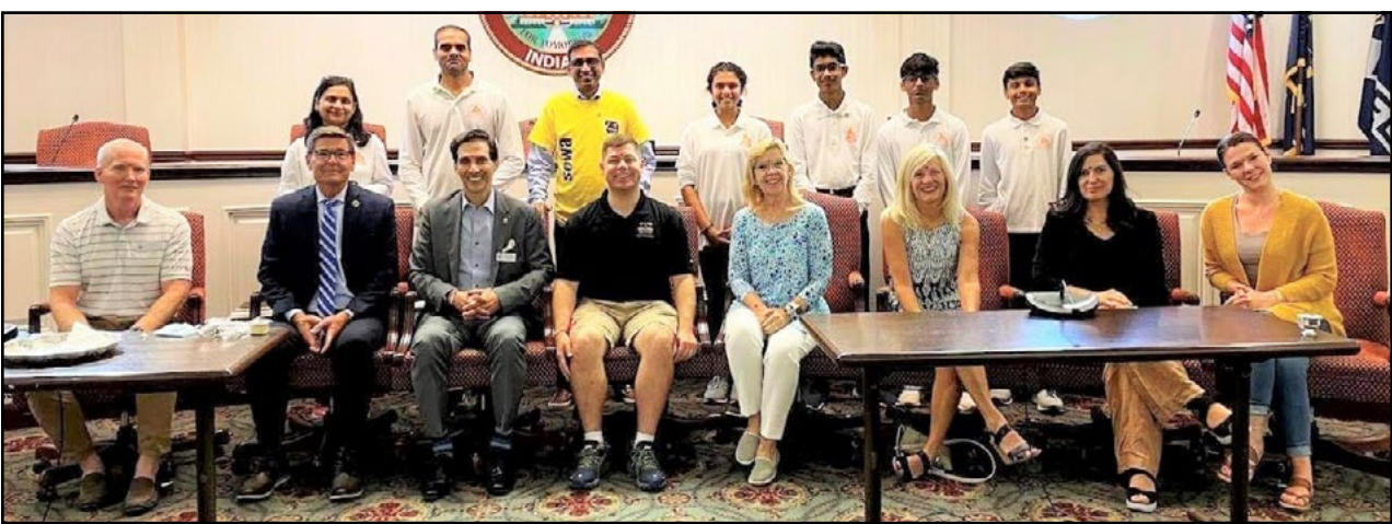
Members of the Hindu Swayamsevak Sangh Carmel chapter and several city officials joined together to celebrate Rakshabandhan, a traditional Hindu celebration of brotherhood and sisterhood.