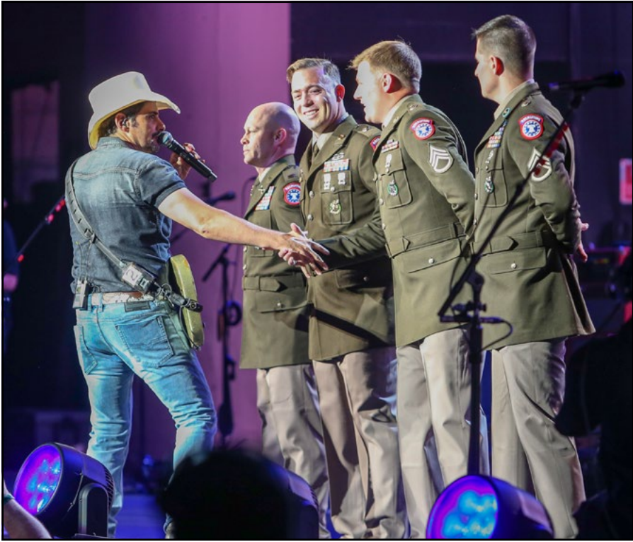
This past weekend brought two well-attended concerts to Ruoff Home Mortgage Music Center. On Saturday Brad Paisley (above) took the stage with a solid opening from Jimmie Allen. On Sunday, the Black Crowes performed. This coming weekend, Phish returns with three shows starting Friday. The following weekend the much-anticipated Dave Matthews Band will entertain on Friday and Saturday.