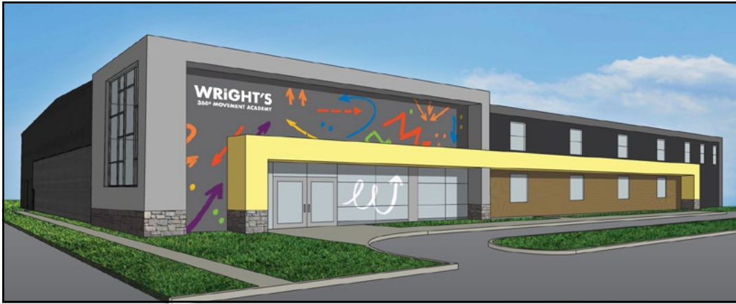
Rendering provided by Wright's 360° Movement Academy

The 35,000 square-foot facility will house four separate