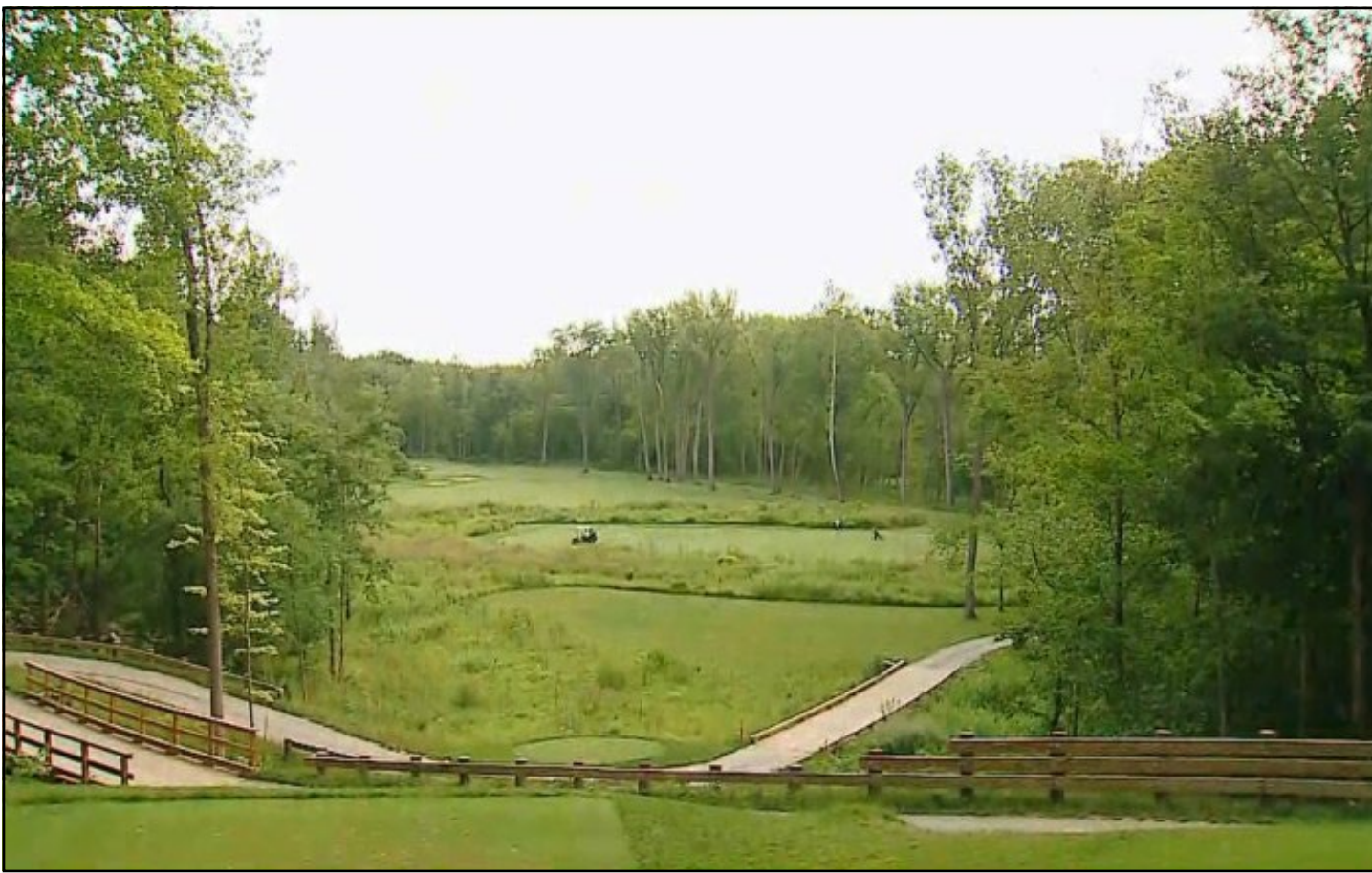
Holliday Farms, the last course designed by Pete Dye, is a golf course that is enjoyable for all golfing abilities. An abundance of trees and varying elevation help to make this course unique.