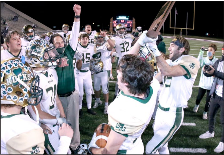
The Westfield football team, shown here after winning the semi-state, finished last season as the Class 6A state runner-up in the 2020 season. The Shamrocks will have the same schedule as last year, which means they open their season by hosting 5A state champion Cathedral Aug. 20 at Riverview Health Stadium.

The other five county schools – Fishers, Hamilton Southeastern, Noblesville, Sheridan and Westfield – did not have any