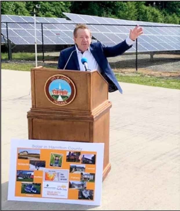
Carmel Mayor Jim Brainard celebrated the opening of the new solar panel array that’s expected to save approximately $1.8 million in utility costs.

years to come.” Construction on the $1.7 million project began in 2020 and features the installation of 2,988 panels that produce 365 watts of power each. In addition to the project site at 106th Street and Gray Road, a second location has been established near 106th Street and Hazel Dell Parkway. The combined locations are already generating enough electricity that could power about 1,230 homes per year. The project was financed through a combination of a low-interest loan from the Indiana Finance Authority’s State Revolving Fund program and a water utility bond. Carmel Utilities will see energy cost savings of $140,000 per year and the average life of a solar panel is 25 to 30 years.