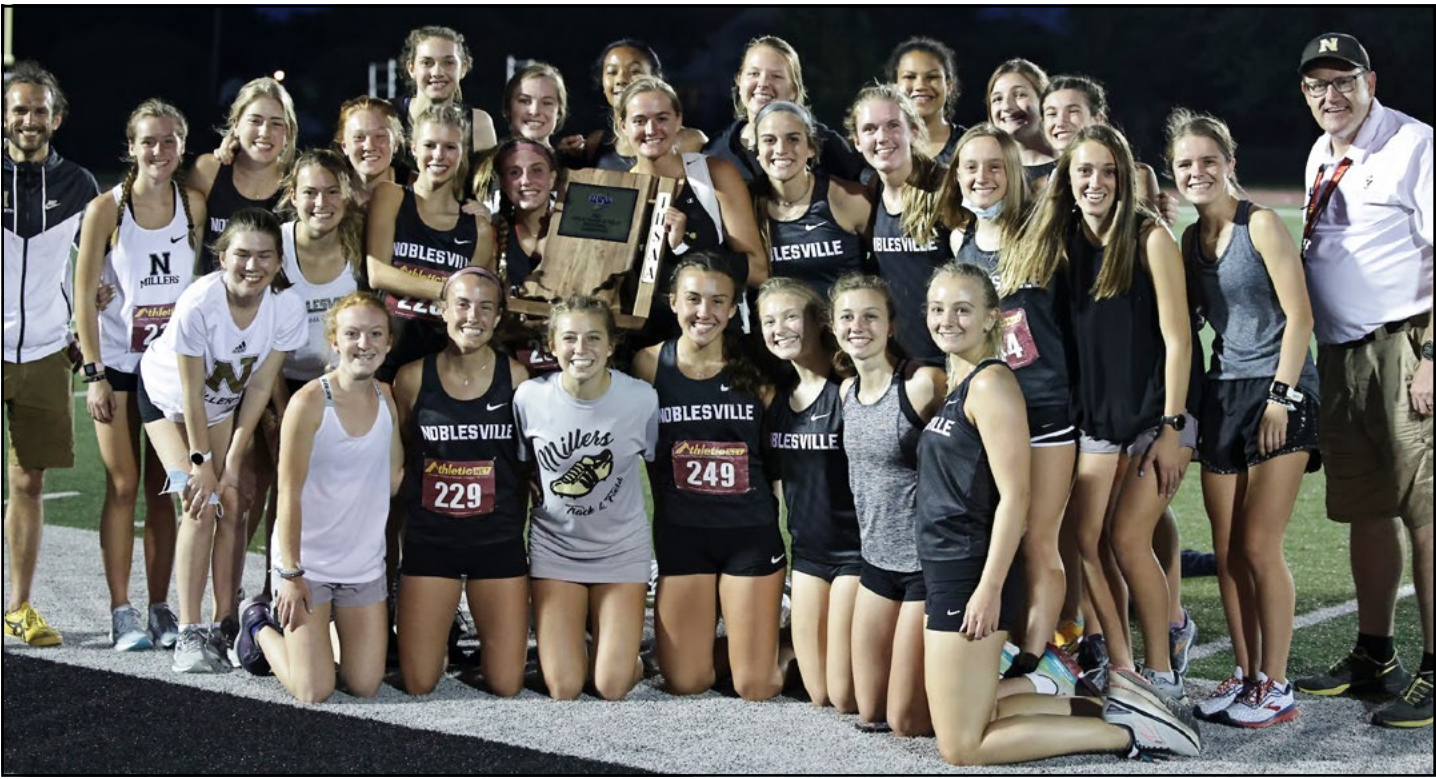
The Noblesville girls track and field team won its first-ever regional championship Tuesday at Lafayette Jefferson. The Millers scored 77 team points, took four individual events and qualified seven to next weekend's state meet at Ben Davis.