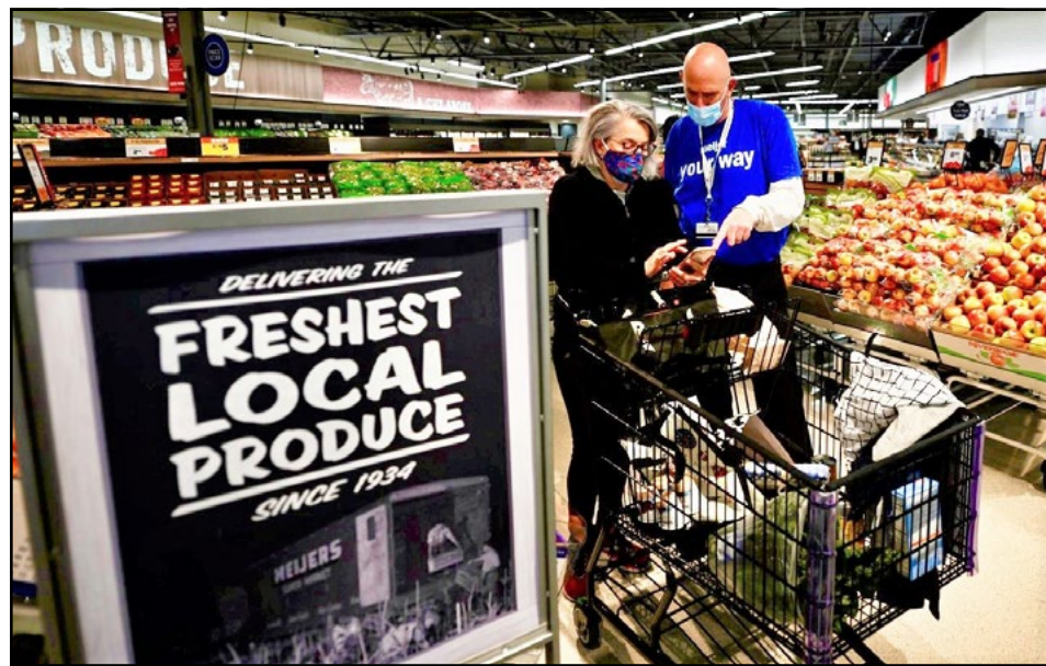
The new store in Westfield is currently operating under adjusted hours and maintaining coronavirus safety measures.