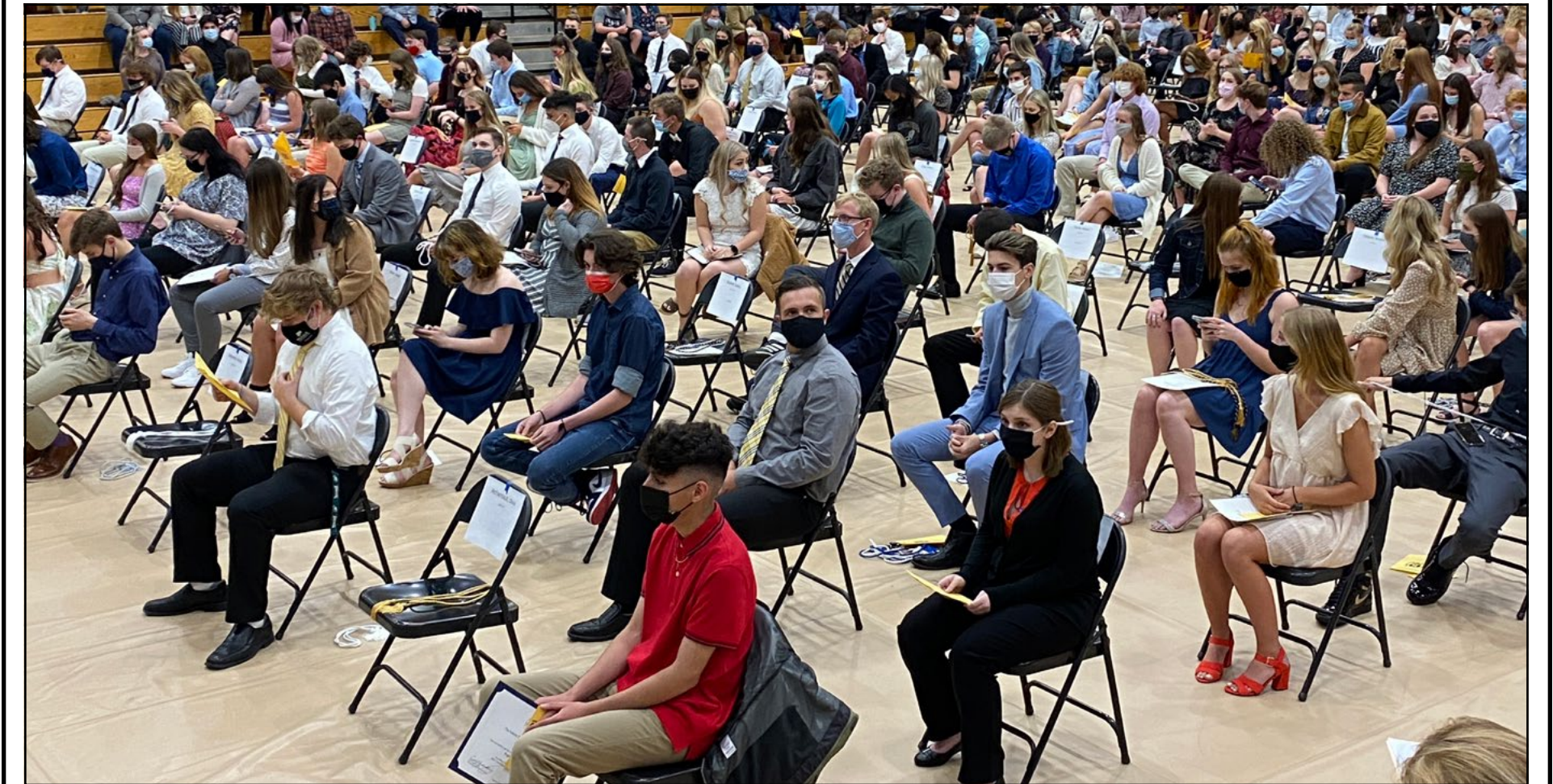
Almost 350 members of the Noblesville High School Class of 2021 were recognized Wednesday evening for their academic achievements and scholarships during the school's annual Senior Honor Night. The Class of 2021 is one of the most accomplished in NHS history, earning a record-setting $5.46 million in scholarships, a 76 percent increase over last year. Out of approximately 700 graduates, five earned a full-ride college scholarship, 37 achieved multilingual proficiency, 300 earned Latin American honors for a 3.5 grade-point average, 116 earned post-secondary education scholarships, and 125 earned local scholarships.