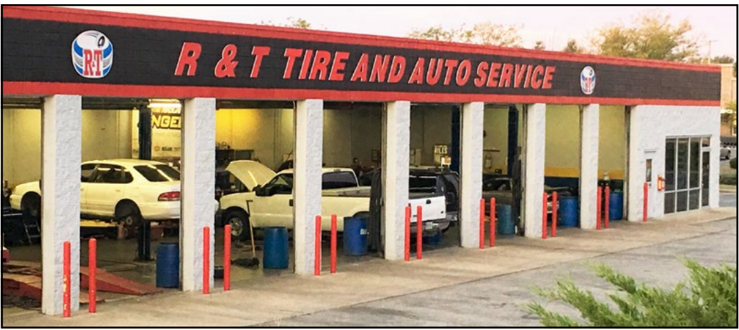
The name may be changing at R&T Tire & Auto Service, but the company and its people say the quality will remain the same.