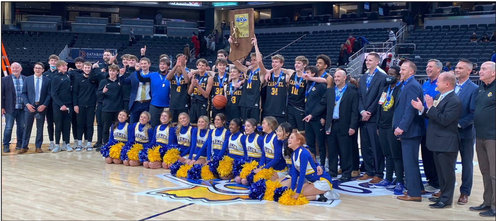
The Carmel boys basketball team won its second consecutive state championship last Saturday at Bankers Life Fieldhouse, holding off Lawrence North in overtime 51-46. The Greyhounds used its trademark defense and solid free-throw shooting to claim the program's fifth state title.