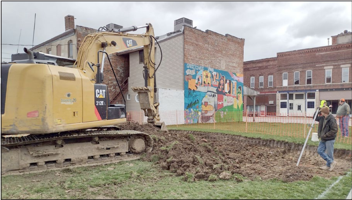
The Town of Arcadia recently broke ground on a new splash pad for residents and visitors to use during the summer months. The splash pad will be located downtown, in the heart of Arcadia, at 126 W. Main St.