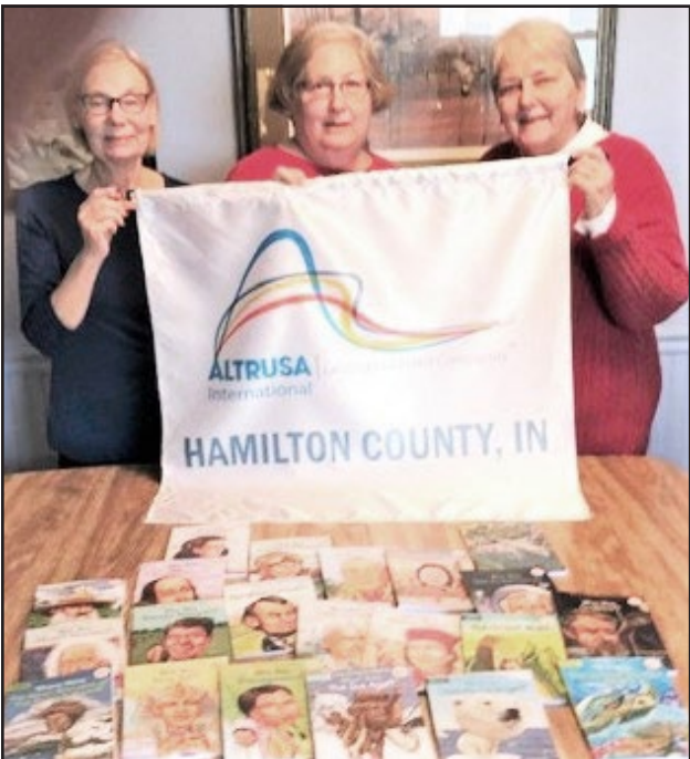
Altrusa of Hamilton County has been hard at work securing grants to help improve literacy through projects and services at the Cicero Library.