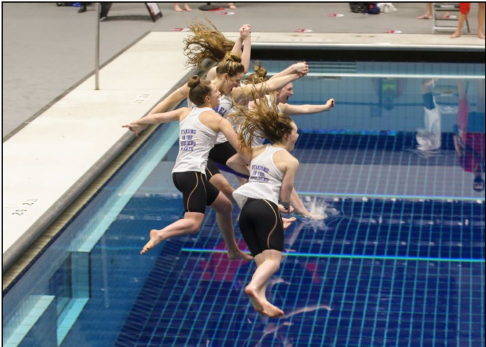
Members of the Carmel girls swim team jump into the diving well after the Greyhounds won their 35th consecutive state championship last Saturday at the IU Natatorium. Carmel scored a state-record 479 points.