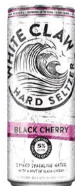
White Claw Hard Seltzer Variety Pack #1 12-12oz cans 13.49