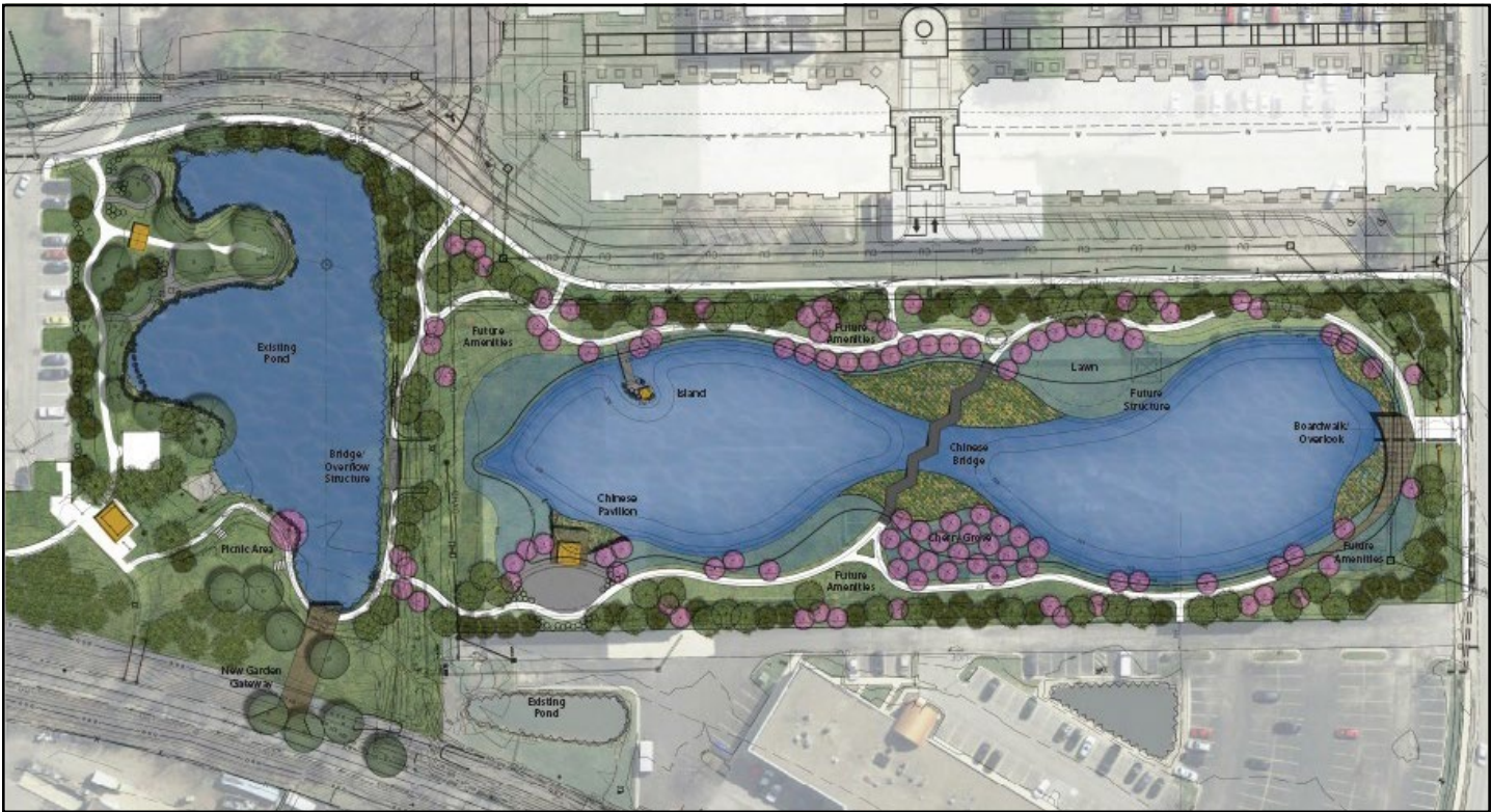
The $17 million project was partially funded through the Clay Township Impact Program, which paid for $3 million in construction costs. Other sources of funding include the 2016 Storm Water Bond.