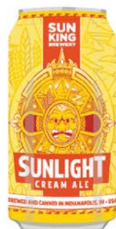
Sun King Sunlight Cream Ale 12-12oz cans 13.99