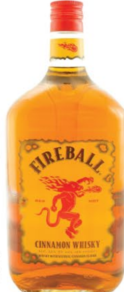
Fireball Cinnamon Whisky 1.75L 17.49