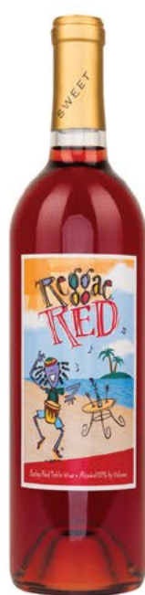
Easley Reggae Red Indiana 750ml 4.97