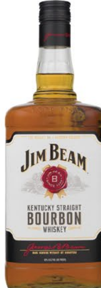
Jim Beam 1.75L 23.99