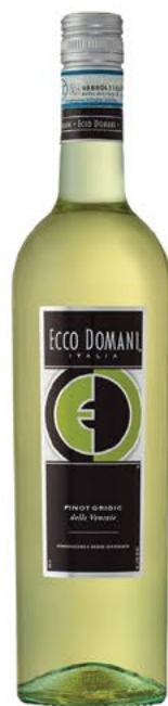
Ecco Domani Pinot Grigio Italy 750ml 7.47