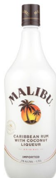
Malibu Coconut Rum 1.75L 18.99