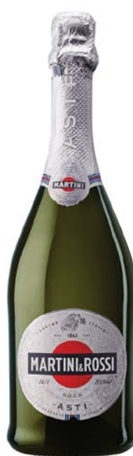
Martini & Rossi Asti Italy 750ml 8.47