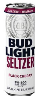
Bud Light Seltzer Variety Pack 12- 12oz cans 13.99