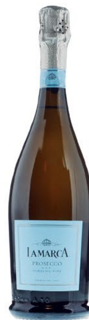
La Marca Prosecco Italy 750ml 10.47