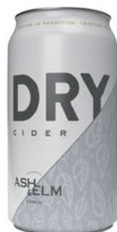
Ash & Elm Dry Cider 4-12oz cans 6.99