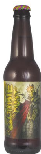
Three Floyds Zombie Dust Pale Ale 6-12oz btls 10.99