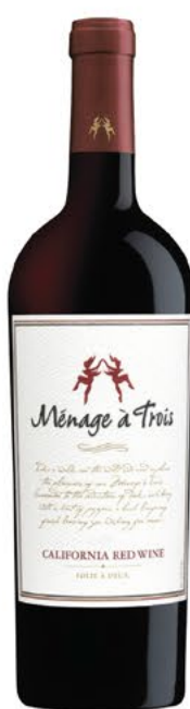
Menage a Trois Red California 750ml 6.47