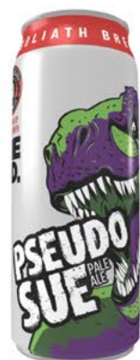
Toppling Goliath Pseudo Sue 4-16oz cans 8.99