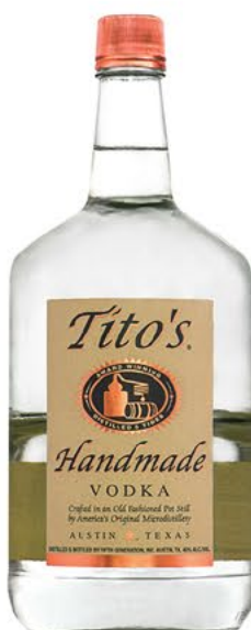
Tito's Handmade Vodka 1.75L 24.99