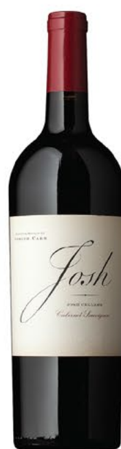
Josh Cellars Cabernet Sauvignon California 750ml 10.47