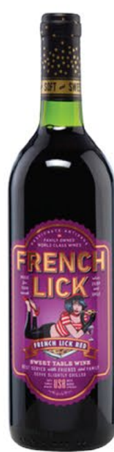
French Lick Red Indiana 750ml 6.97