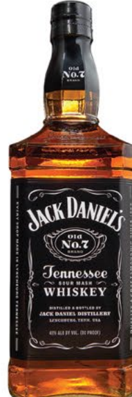
Jack Daniel's Black 1.75L 34.99