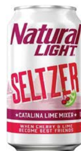
Natural Light Seltzer Variety Pack 12-12oz cans 8.49