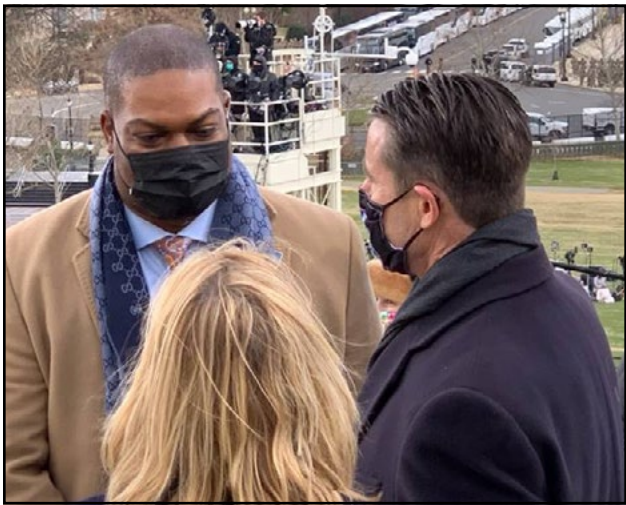
U.S. Senator Todd Young (right) thanked Capitol Police Officer Eugene Goodman (left) at the Inauguration on Jan. 20.

"Officer Goodman is a hero. He protected our democracy by holding off and then diverting a violent mob away from the Senate chamber," Sen. Van Hollen said. "His actions on January 6 saved lives – including those of many of our Senate colleagues and staff. Maryland is proud to call him one of our own, and I'm honored to introduce