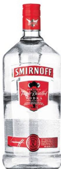
Smirnoff 1.75L 14.99