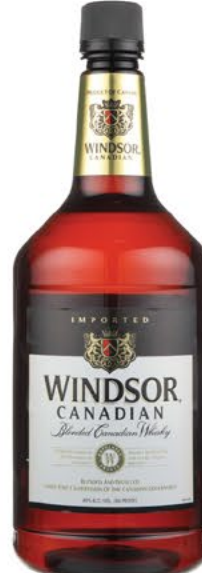
Windsor Canadian 1.75L 9.99