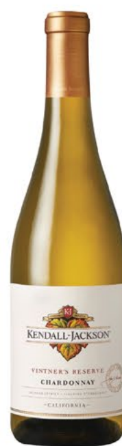
Kendall Jackson Vintner's Reserve Chardonnay California 750ml 8.97