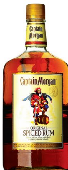
Captain Morgan Spiced Rum 1.75L 19.49