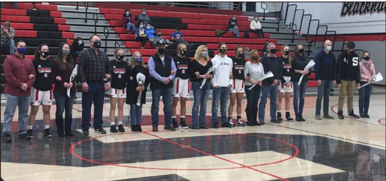
The Sheridan girls basketball team honored its seniors Saturday during the Blackhawks' game with Tri-Central. Sheridan beat the Trojans 47-43 for its sixth straight victory.