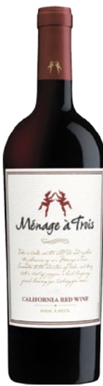
Menage a Trois Red California 750ml 6.47