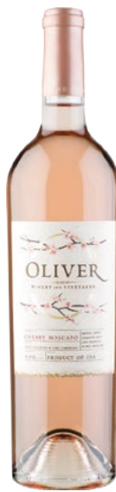
Oliver Cherry Moscato, Blueberry Moscato, VS Moscato, Peach Pie Indiana 750ml 6.97