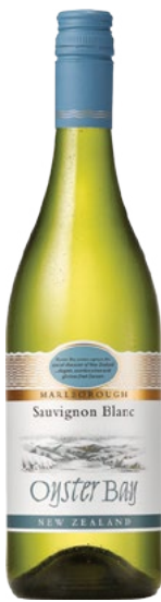
Oyster Bay Sauvignon Blanc New Zealand 750ml 7.47