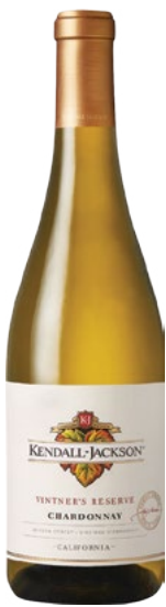
Kendall Jackson Vintner's Reserve Chardonnay California 750ml 8.97