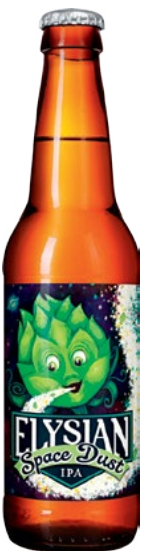
Elysian Space Dust IPA 6-12oz btls 8.99