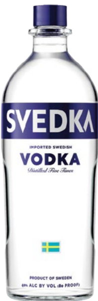
Svedka Vodka 1.75L 14.99