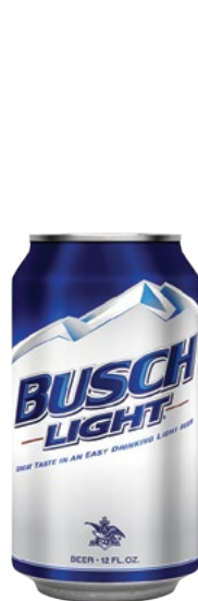
Busch Light 30-12oz cans 17.99