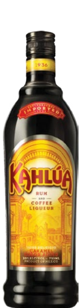
Kahlua 750ml 14.99