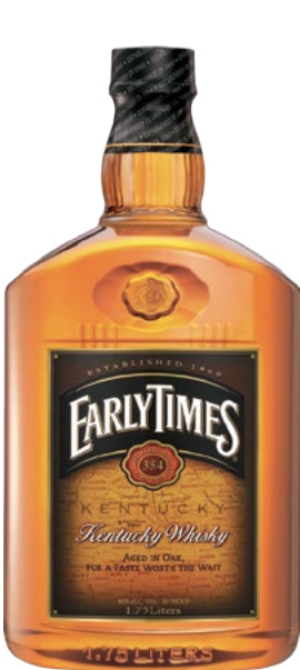
Early Times 1.75L 15.99