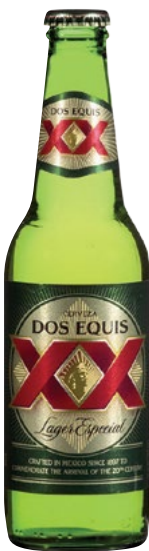
Dos Equis Lager Especial 12-12oz btls 12.49