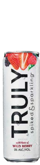
TRULY Berry Variety Pack 12-12oz cans 13.99