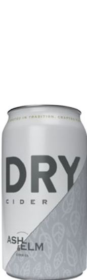
Ash & Elm Dry Cider 4-12oz cans 6.99