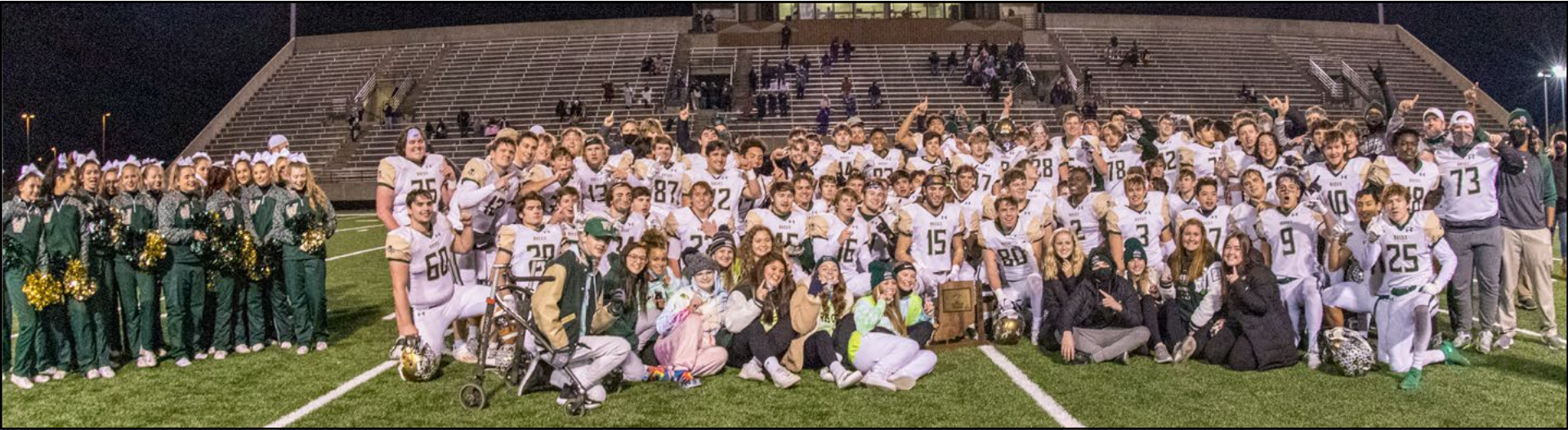
The Westfield football team is headed back to state, this time to play in the Class 6A state championship game. The Shamrocks won the 6A north semi-state last Friday, beating host Merrillville 41-23.