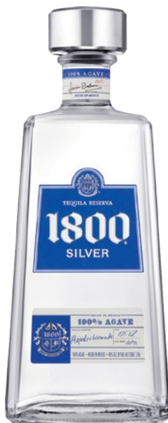
1800 Silver Tequila 1.75L 29.99