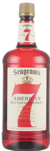
Seagram's 7 1.75L 14.99