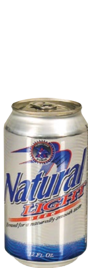
Natural Light 30-12oz cans 14.99