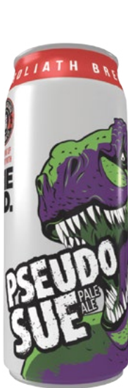
Toppling Goliath Pseudo Sue 4-16oz cans 8.99