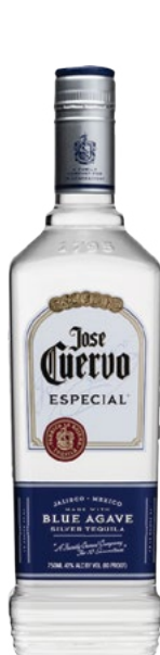
Jose Cuervo Especial Silver Tequila 750ml 12.99