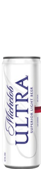
Michelob Ultra 24-12oz cans 19.99