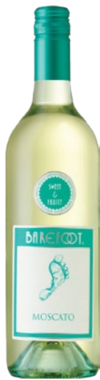
Barefoot Cellars Moscato, All Varietals California 750ml 3.97