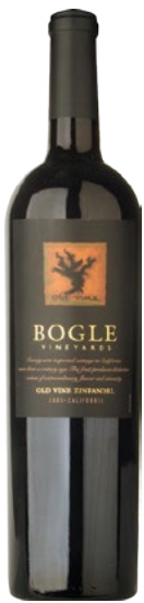
Bogle Zinfandel Old Vine California 750ml 5.97