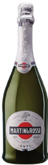
Martini & Rossi Asti Italy 750ml 8.47