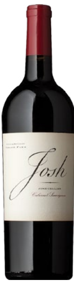
Josh Cellars Cabernet Sauvignon California 750ml 10.47