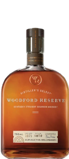
Woodford Reserve 750ml 26.99