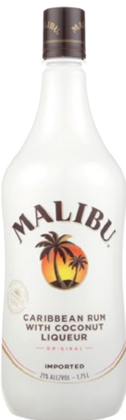
Malibu Coconut Rum 1.75L 18.99