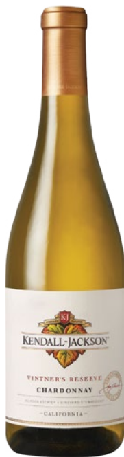
Kendall Jackson Vintner's Reserve Chardonnay California 750ml 8.97