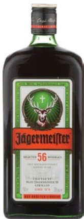
Jagermeister 750ml 16.99