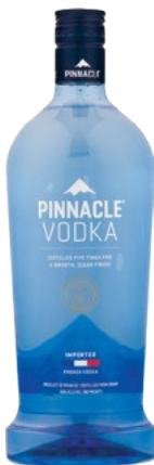
Pinnacle Vodka 1.75L 12.99