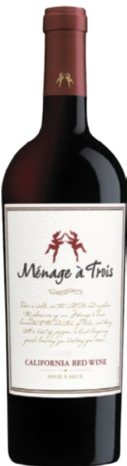
Menage a Trois Red California 750ml 6.47