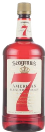
Seagram's 7 1.75L 14.99