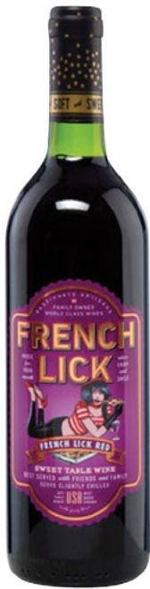
French Lick Red Indiana 750ml 6.97