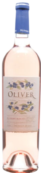
Oliver Blueberry Moscato, Cherry Moscato Indiana 750ml 6.97