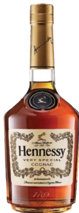
Hennessy VS 750ml 28.99