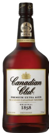
Canadian Club 1.75L 15.99