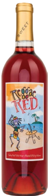
Easley Reggae Red Indiana 750ml 4.97