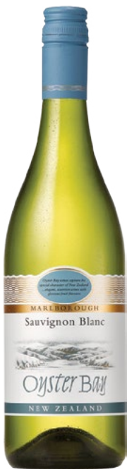
Oyster Bay Sauvignon Blanc New Zealand 750ml 7.47