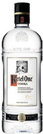
Ketel One 1.75L 26.49