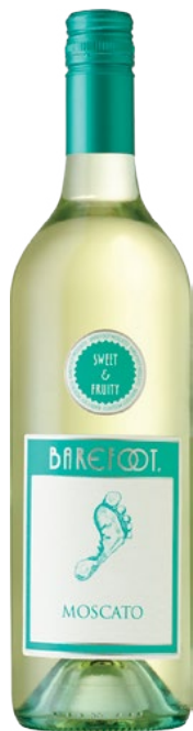
Barefoot Cellars Moscato California 750ml 3.97