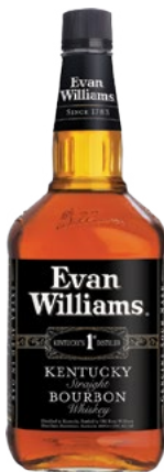
Evan Williams 1.75L 18.99