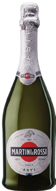
Martini & Rossi Asti Italy 750ml 8.47