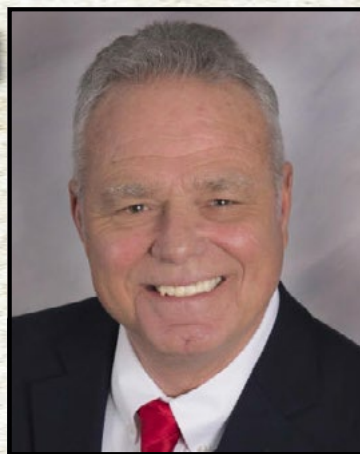
Brad Beaver County Council At-Large

Choose Republican Leadership For Your County Council This November