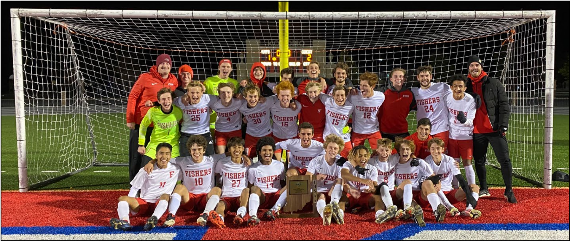
The Fishers boys soccer team made history on Saturday when it won the program's first-ever regional championship. The Tigers triumphed at the Kokomo regional over Homestead and Fort Wayne Carroll, and will now play Saturday at South Bend St. Joseph for a semi-state championship.