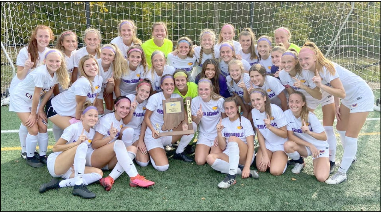
The Guerin Catholic girls soccer team beat North Central 2-1 last Saturday to win Class 3A Sectional 10 at the Golden Eagles’ field. The championship is the first in three years for Guerin Catholic.

feels like a lot of pressure has been lifted off our back. A few years ago, we were the underdogs. Now, currently we have the target on our back. It just feels amazing that you have the girls really earn that next sectional championship three years later from when they were freshmen in high school.”