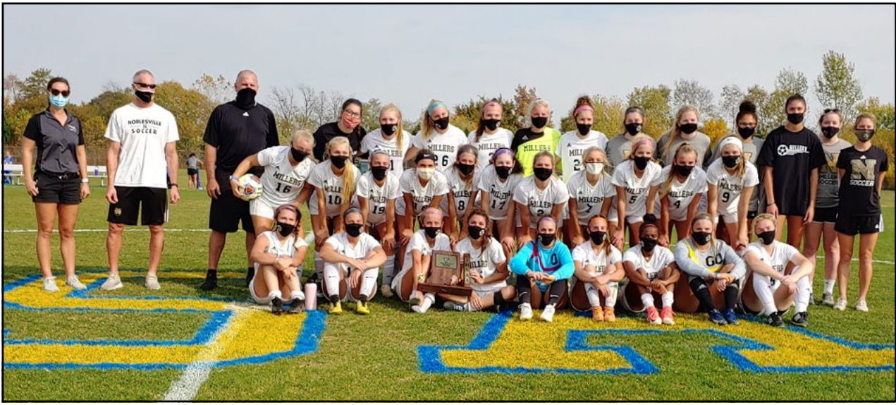
The Noblesville girls soccer team won the Class 3A Sectional 8 championship last Saturday, beating Hamilton Southeastern 2-1. It’s the Millers fourth sectional title in the past five years.