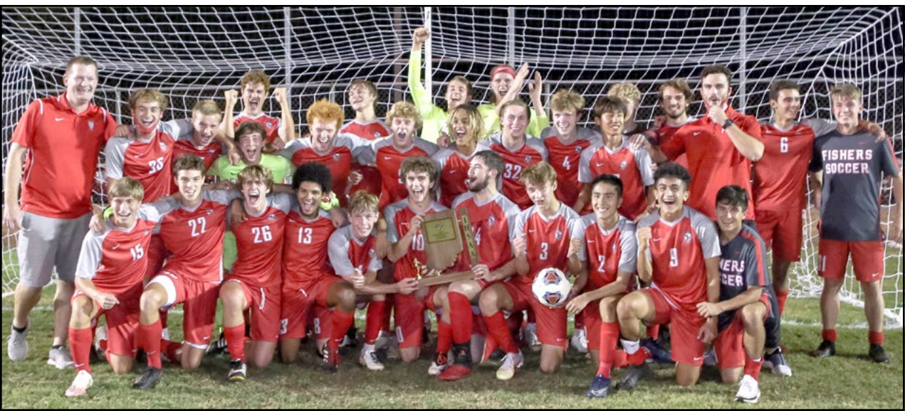
The Fishers boys soccer team won its first sectional championship in six years last Saturday. The Tigers beat Hamilton Southeastern 1-0 to win Class 3A Sectional 8 at the Royals’ field.

Fishers will play at the Kokomo regional on Saturday, taking on Homestead in the first semi-final, which begins at 10 a.m. The other semi-final will see No. 8 Fort Wayne Carroll playing McCutcheon, and starts at noon. The winners will advance to the