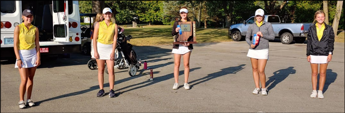
Noblesville won its first regional title since 2007 at the Lapel regional, which took place last Saturday at Edgewood Golf Club in Anderson. The Millers also qualified for this weekend's state meet at Prairie View Golf Club.