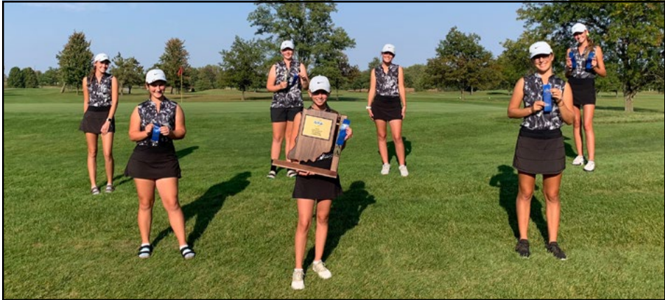
The Westfield girls golf team won its first regional championship since 2016 last Saturday at the Roncalli regional, which took place at Smock Golf Course in Indianapolis. The Shamrocks also qualified for the state meet.