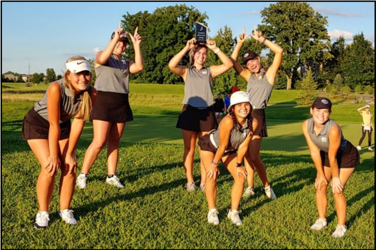
The Hamilton Southeastern girls golf team won the Mudsock dual meet last Tuesday at Grey Eagle Golf Course. The seventh-ranked Royals scored a 169 to win the trophy.