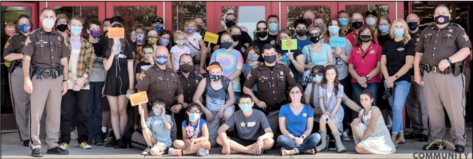
The Hamilton County Sheriff's Office Community Foundation was excited to host its first ever community event. The Foundation partnered with local businesses and sponsors to provide "Back to School" shopping for more than 20 Hamilton Heights students. Each student received new clothing, a backpack filled with school supplies, a lunch box, a gift certificate for a back-to-school haircut, sunglasses and more. The organization thanked the sponsors and volunteers who participated in the event. The HCSO Community Foundation is dedicated to giving back to the community through volunteerism, donations and community engagement. For donation information or to stay updated on other ways the Foundation gives back to the community, please visit hcsocommunityfoundation.com .