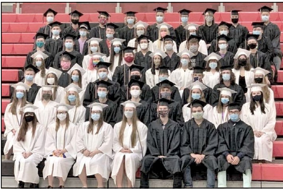
Thanks to guests adhering to mask and social distancing policies, Sheridan High School was able to hold graduation for the Class of 2020.