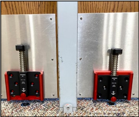
Approximately 1,000 of these door barricading devices have been installed across Noblesville Schools.