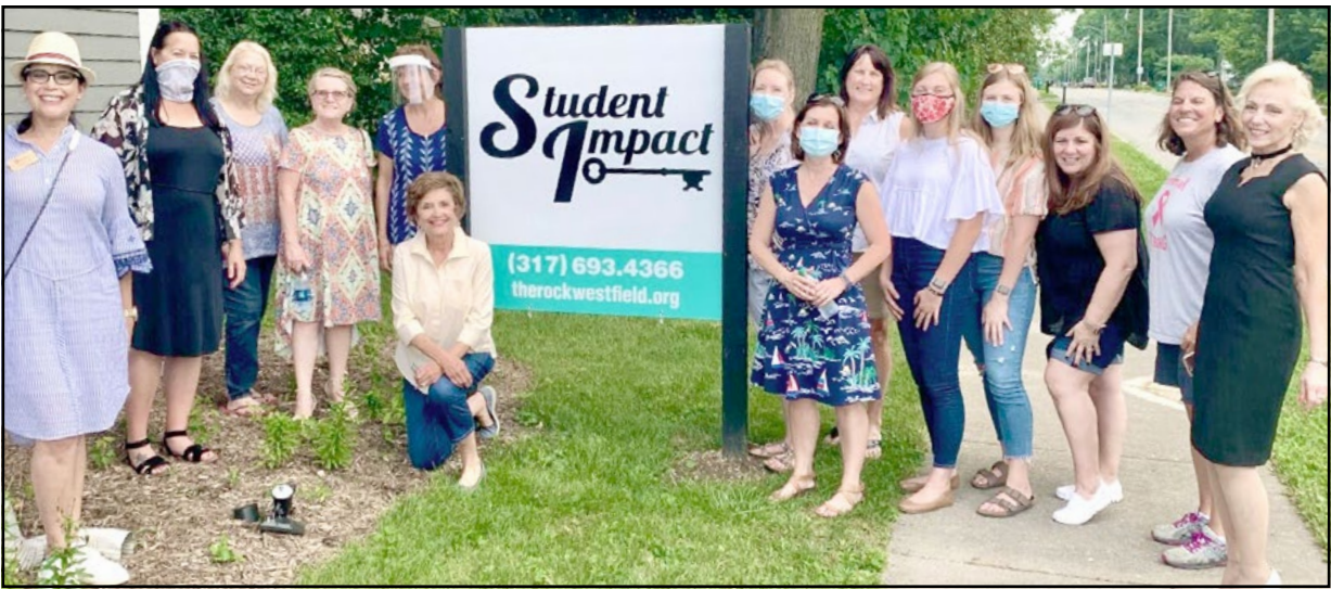
The Hamilton County Republican Women's Club held its Day of Service on July 6. Members donated and volunteered in assisting Student Impact of Westfield with the group's efforts to help the homeless in local communities with much-needed supplies. HCRW says it looks forward to volunteering in other ways and to continue serving Hamilton County.