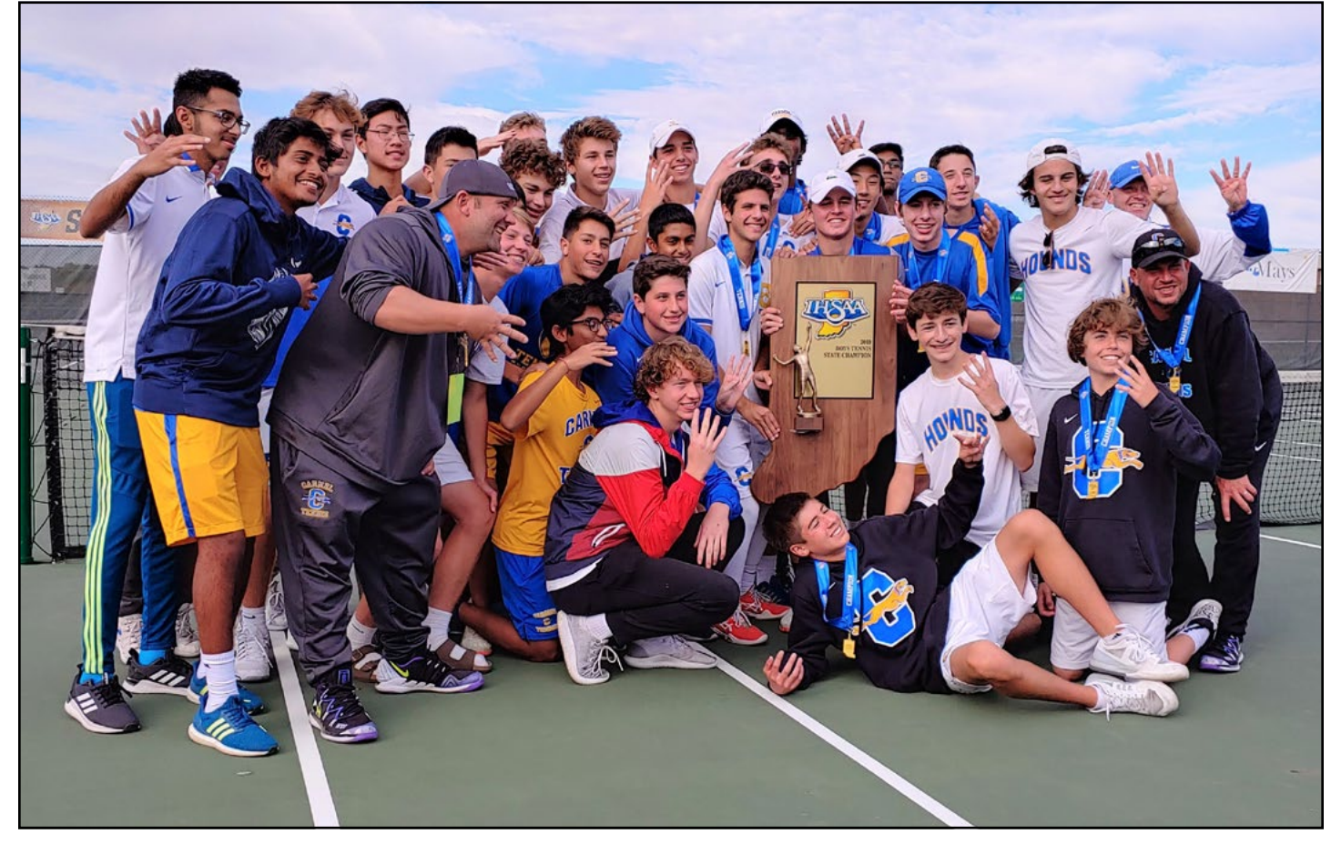
The Carmel boys tennis team won its fourth consecutive state championship, then followed that up with wins in the singles and doubles tournament.

In boys soccer action, two teams also broke sectional droughts. Noblesville won its first title since 2013 with a 4-3 win over Hamilton Southeastern, while Guerin Catholic was triumphant for the cer was first sanctioned by the association first time since 2014 with a 3-1 victory over Brebeuf Jesuit. Both teams followed their sectional wins up with regional titles. Sheridan made a run at its own sec-