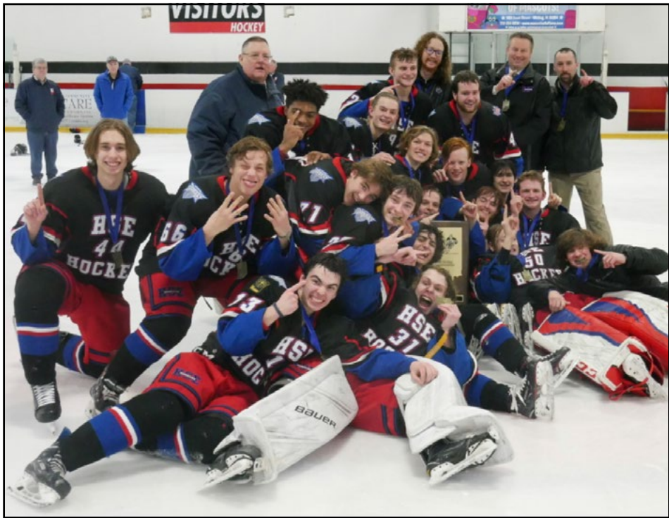
The Hamilton Southeastern Hockey Club's "A" team won the Indiana State High School Hockey Association's Class 4A state championship game on Saturday, March 7. The HSE "A" team beat St. Joseph 1-0. Southeastern's "B" team also reached the 1A state championship game.