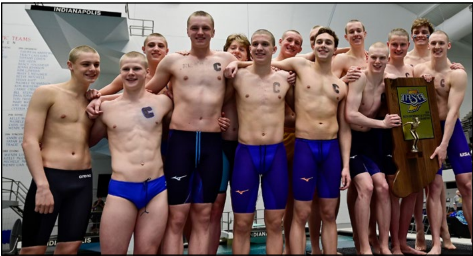
The Carmel boys swim team won its sixth consecutive state championship last Saturday at the IU Natatorium. The Greyhounds won six events, including five in new state record time.