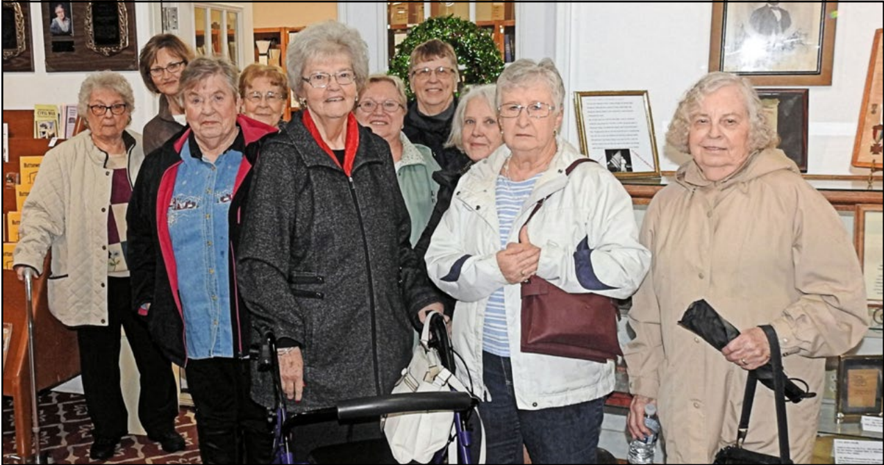
The North Adams Extension Homemakers were treated with a tour of the Sheridan Historical Society.