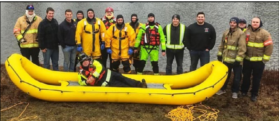
For the second year in a row, Jackson Township Fire has put on an Ice Rescue Technician Class. Recently, Jackson Township Fire was joined by members of Tipton Fire Department and White River Township Volunteer Fire Department in completing the first phase of Certification. Phase 2 will include all “on the Ice” Rescue Practicals, so firefighters are hoping Indiana will help out with some ice this year.