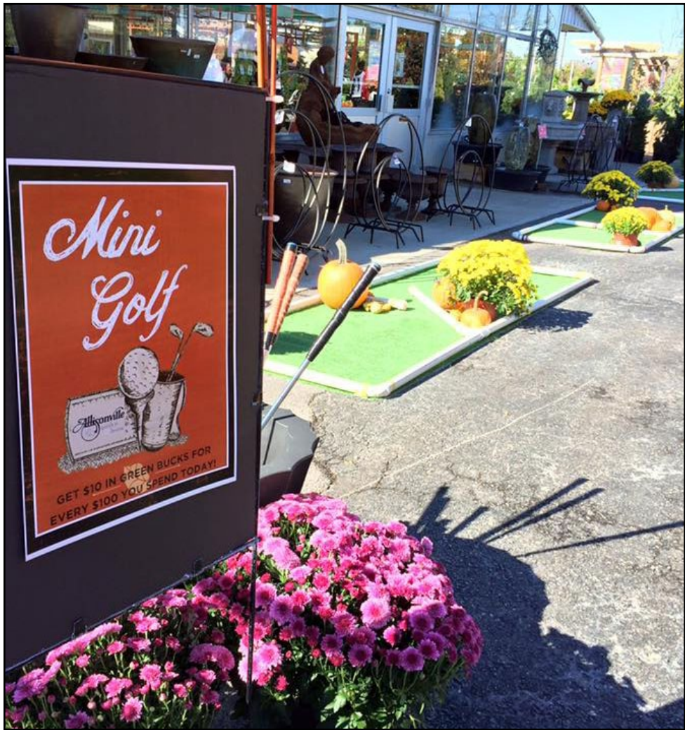
Families can enjoy playing mini golf at the Allisonville Garden & Home Fall Festival.

Highlights include hayrides, pumpkin and face painting, walk-llama and llama kissing booth, fall games, Porkopolis food truck and more. Bring the entire family dressed up in costume or your best jamboree outfit and get a fall prize.